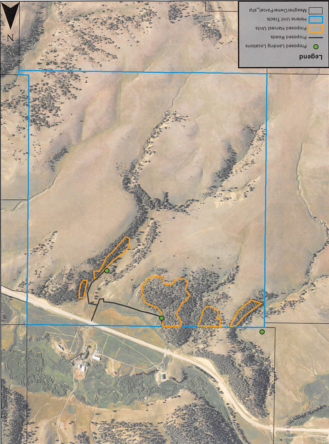
Proposed Cneckerboarda Timber Permit T09N R10E Section10 Meagher, County Montana