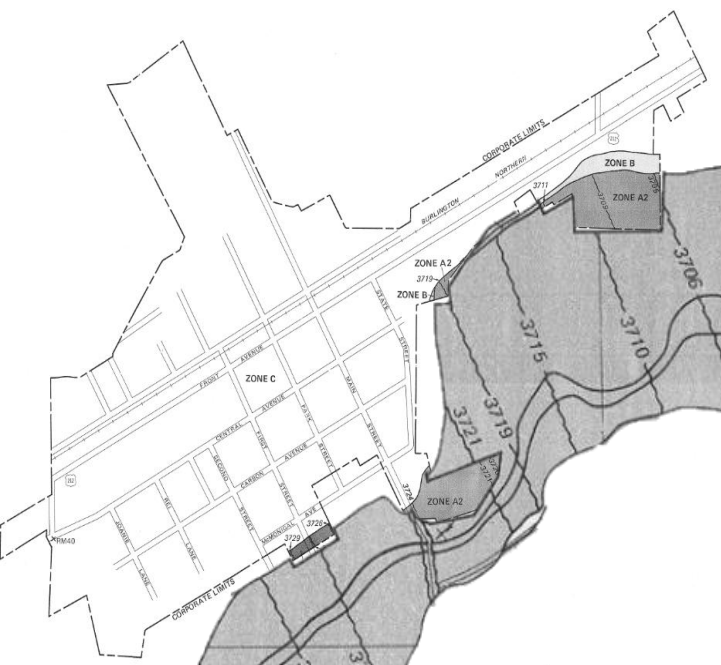
Town of Joliet map from original 1980 study

Carbon County floodplain maps were modernized through a Digitized Flood Insurance Rate Map (DFIRM) project in 2012. The maps were converted from paper to the digital environment. Most of the mapped floodplains in the county are still based off flood studies from the late 1970s and early 1980s. The 2012 DFIRM project entailed digital conversion of the effective floodplains in the county, except for revised hydraulics and mapping on 9 miles of the Clarks Fork of the Yellowstone (upstream from the Carbon/Yellowstone County border). This revision, however, did not include updated hydrology or survey data. In 2017 a Partial Mapping Revision (PMR) was completed for the portion of the Yellowstone River in the county. The PMR leveraged US Army Corps of Engineers information from a Yellowstone River corridor study and updated floodplain mapping in Stillwater and Yellowstone Counties to update and replace the approximate floodplain mapping on the Carbon County side of the Yellowstone River with enhanced and floodway mapping.