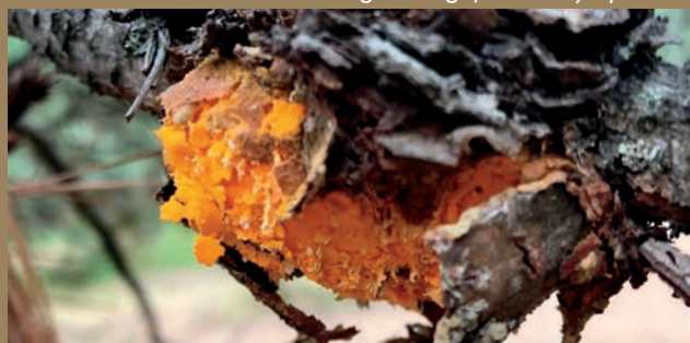
Western Gall Rust Producing Orange, Powdery Spores

Western gall rust stimulates the growth of round swellings that eventually kill branches or create weak points in the main stem of pines, including lodgepole and ponderosa. Live galls produce bright orange, powdery spores that infect other pines. Trees can live with western gall rust for many years but as branches continue to be infected and die, tree vigor declines.