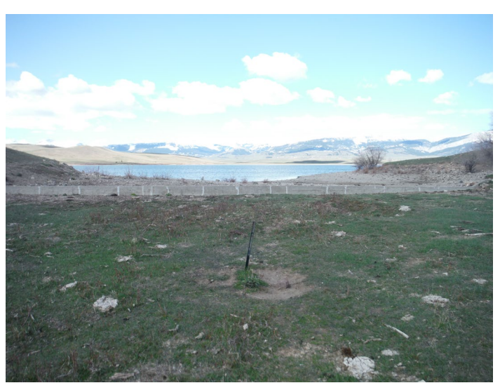
Spillway at East Dam