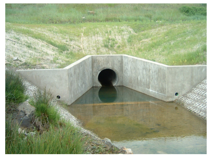
Outlet Terminal Structure at North Dam