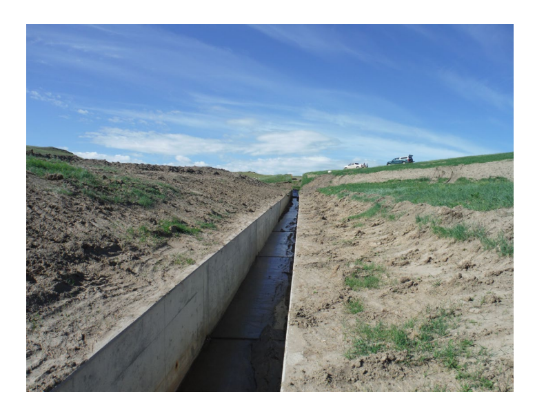
Spillway Chute at East Dam