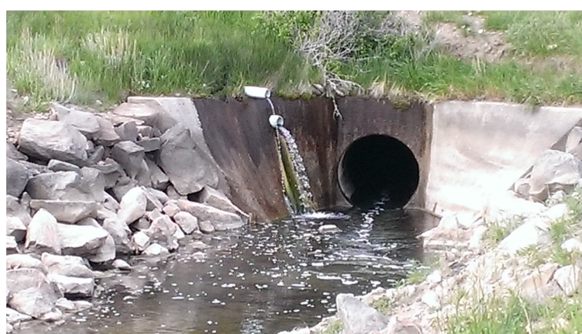
Outlet at North Dam