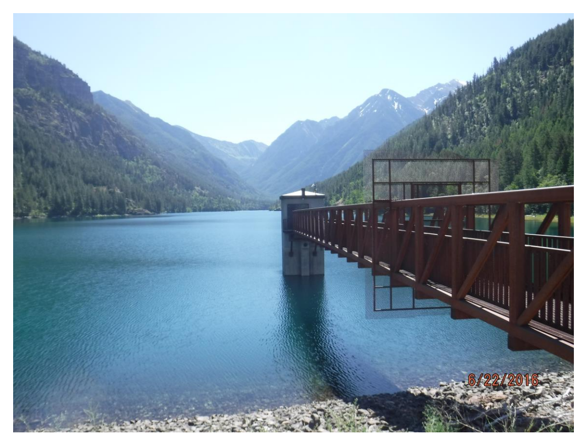
Flathead Indian Reservation, MT