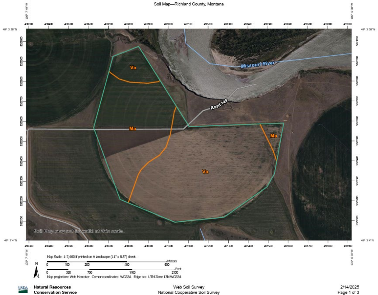
Figure 2: Place of Use Soil Composition Map