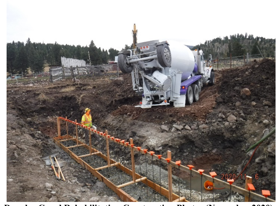
Douglas Canal Rehabilitation Construction Photos (November 2020)