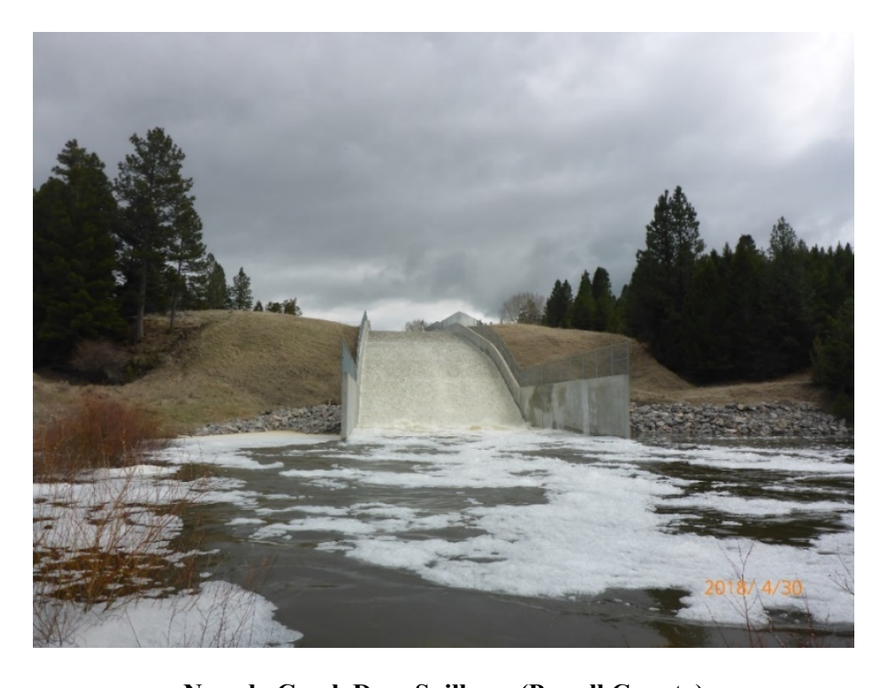
Nevada Creek Dam Spillway (Powell County)

Other non-DNRC projects recommended for funding through the RRGL program include wastewater systems, municipal drinking water, water management, and irrigation water conveyance (not related to storage). Detailed project information and rankings on these non-state-owned projects can be viewed on the DNRC Grants and Loans Website at: http://dnrc.mt.gov/divisions/cardd/resource-development