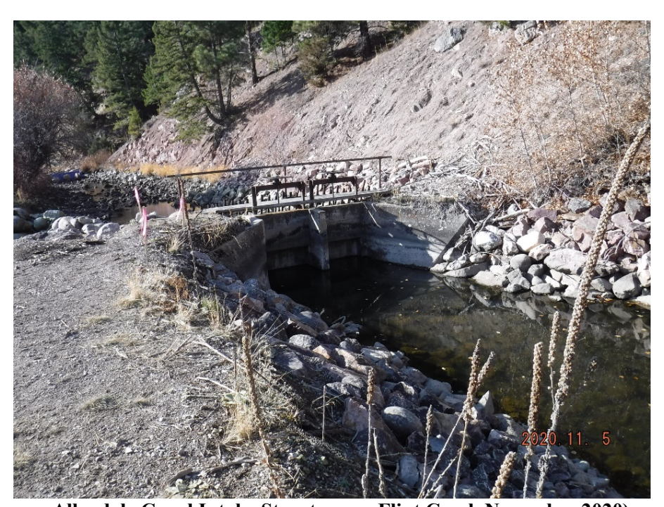
Allendale Canal Intake Structure on Flint Creek November 2020)