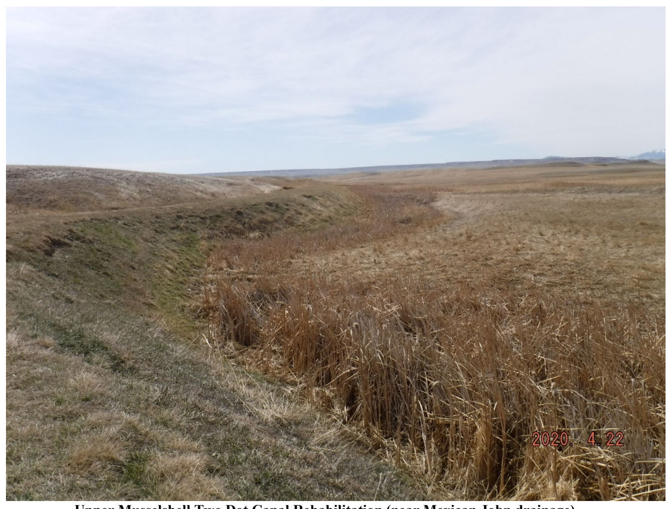
Upper Musselshell Two Dot Canal Rehabilitation (near Mexican John drainage)