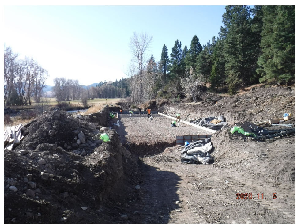
Allendale Canal Fish Screen Installation