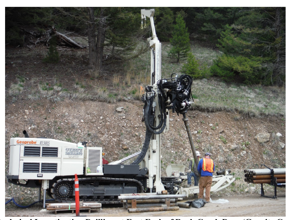
Geotechnical Investigation Drilling at East Fork of Rock Creek Dam (Granite County)