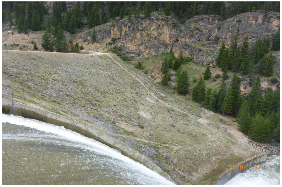
Toe area of Painted Rocks Dam, currently inaccessible by vehicle without fording river.