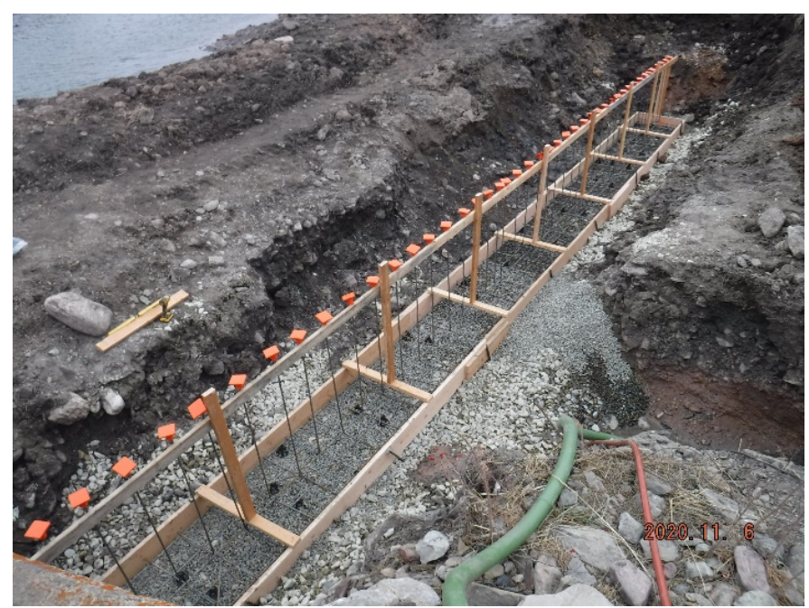
Douglas Canal Rehabilitation Construction Photos (November 2020)