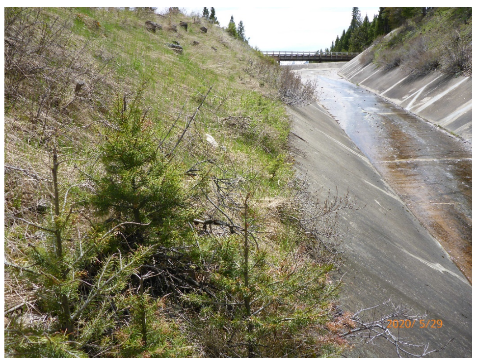
East Fork of Rock Creek Dam Spillway (Granite County)