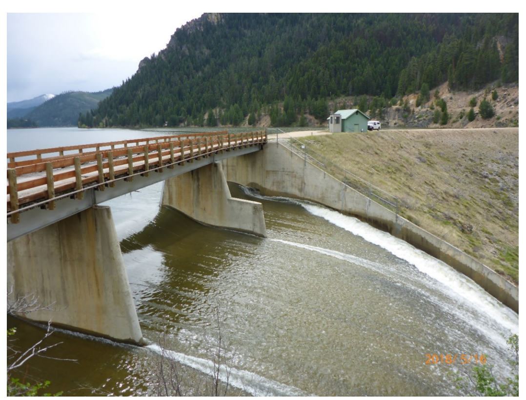
Painted Rock Dam and Reservoir