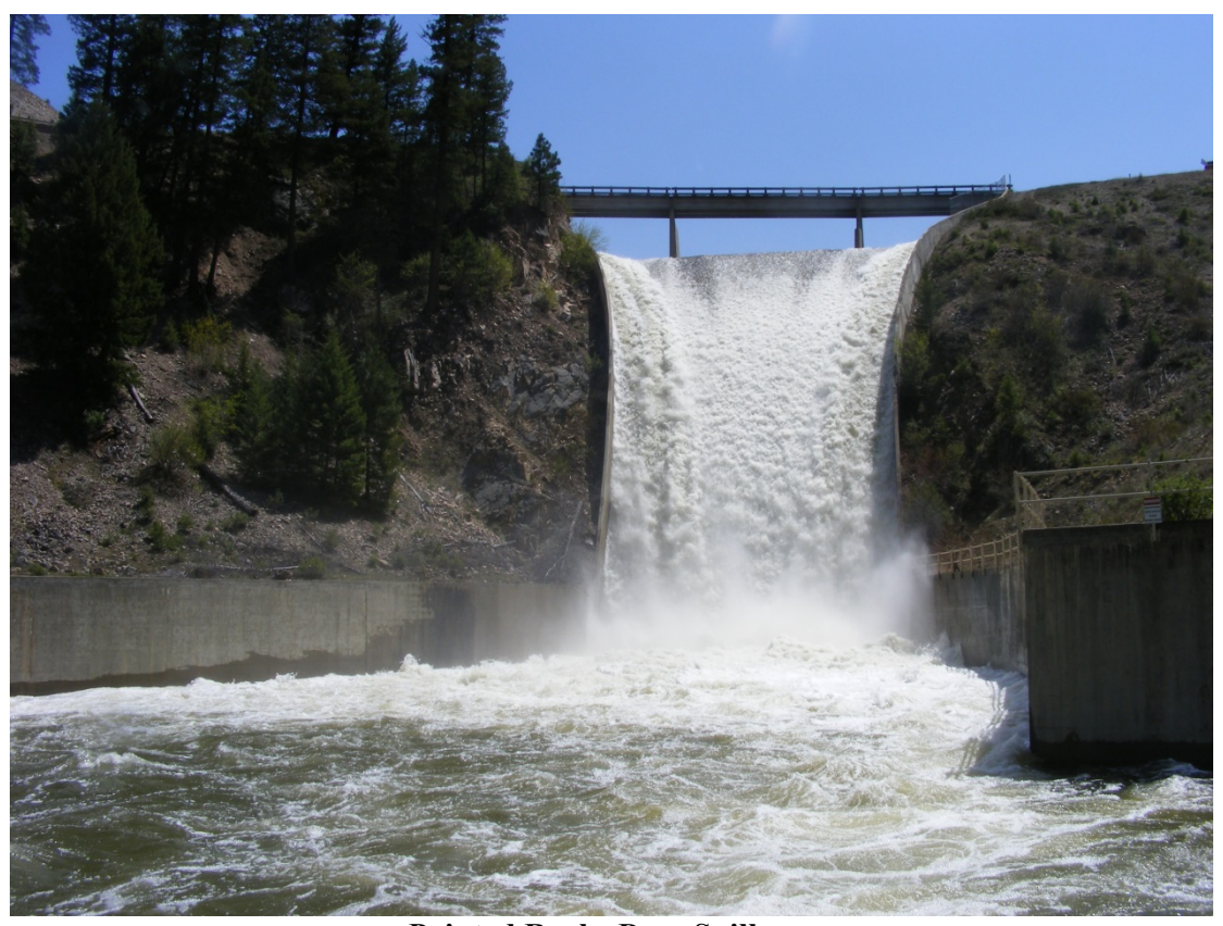
Painted Rocks Dam Spillway

• On-going. Anticipated completion by the summer of 2021