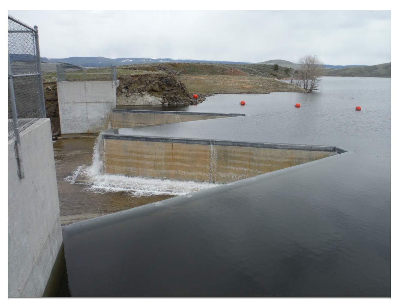
North Fork Smith River Dam, Meagher County

Montana Department of Natural Resources and Conservation Water Resources Division 1424 9<sup>th</sup> Ave. P.O. Box 201601 Helena, MT 59620-1601 Telephone (406) 444-6646 Fax (406) 444-0533 <a href="http://dnrc.mt.gov/wrd">http://dnrc.mt.gov/wrd</a>