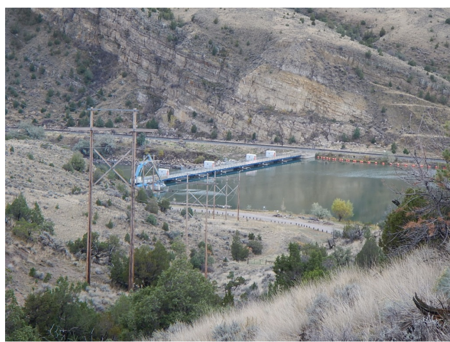
Broadwater Power Project, Missouri River near Toston, Montana