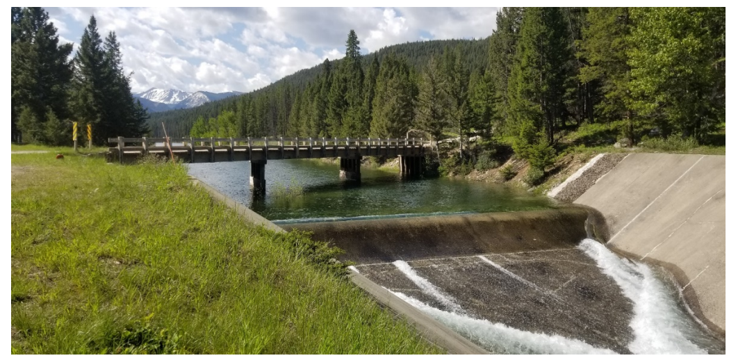
East Fork of Rock Creek Dam Spillway