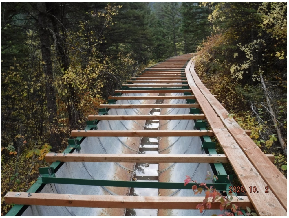
Middle Creek Cottonwood Canal North Flume (Gallatin County)

The SWPB ensures that projects are operated and maintained in a safe, efficient manner, are kept to current dam safety standards, and that repayment contracts are properly administered. The SWPB is also responsible for overseeing repairs, maintenance, and rehabilitation of approximately 250 miles of irrigation canals associated with state-owned projects. Canals are integral components of many state water projects, delivering water to off-stream reservoirs and water users served by the respective projects. The SWPB is responsible for identifying and correcting operational deficiencies on these canals, which includes maintaining and operating over 40 canal gauge stations to monitor water deliveries.