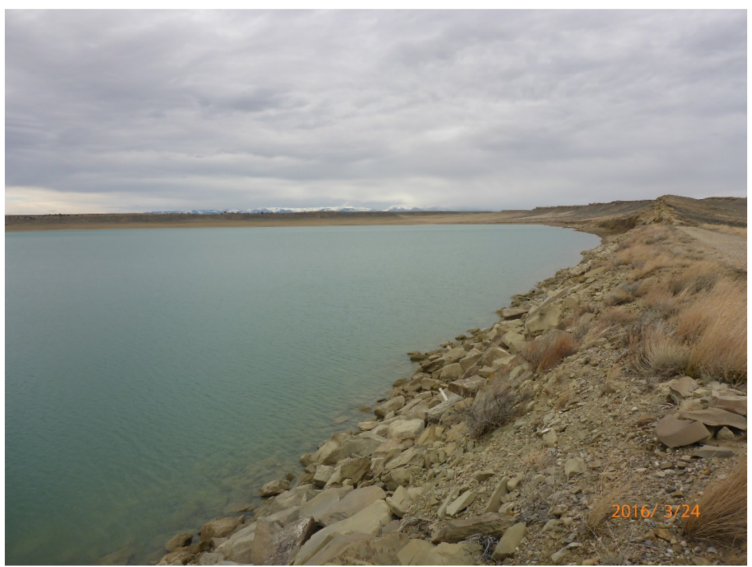
Deadman's Basin Dam (Wheatland County)