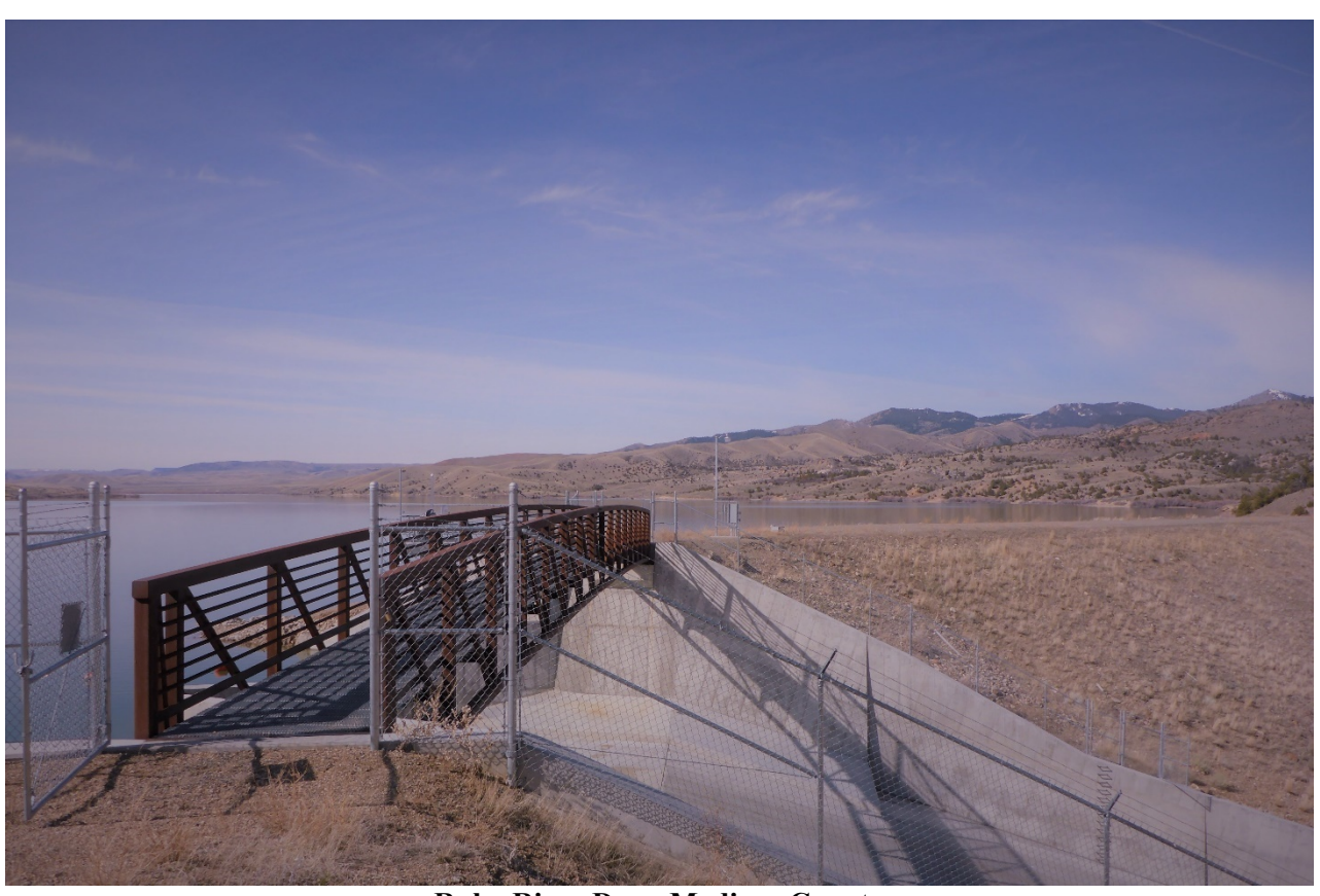
Ruby River Dam, Madison County