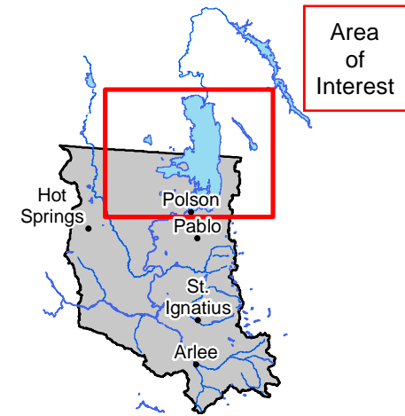
Flathead Indian Reservation