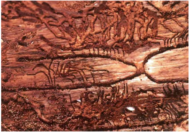
Figure 5. Egg and larval galleries of Ips pini in ponderosa pine.

The beetle spends the winter almost exclusively in the adult stage, except in warmer, drier areas where some older larvae and pupae may overwinter. Adults overwinter under the bark of infested trees and slash or in duff and litter on the forest floor.