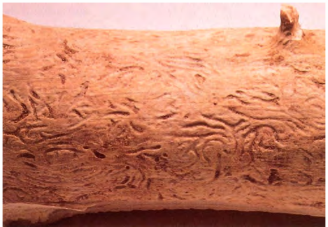
Figure 6. Mazelike galleries of Ips pini produced during feeding attacks in late summer.

In most parts of the beetle's range, two or three generations per year are common. The first flight usually begins in April or May when the daily maximum temperatures reach 60-70 degrees F. As overwintering beetles become active, they infest fresh slash or trees damaged by wind or snow. This generation normally does not successfully attack standing green trees. However, populations can build up in slash with subsequent generations attacking and killing live trees, although if new slash is available, it will be infested first. At high elevations in the north, only one generation occurs in some years. As many as five generations may occur in southern California.