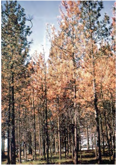
Figure 2. Ponderosa pines killed and top-killed by the pine engraver.

The first indication of attack is reddish-orange boring dust which appears in small mounds on the surface of logs or logging slash at points of beetle entry (figure 3). Spring rains may wash the boring dust off the top surfaces, but it can usually be found in bark crevices or on the ground beneath the slash. In standing trees, boring dust lodges in bark crevices, spider webs, and on the ground at the base of the tree. Foliage of infested standing trees usually begins fading within a few months of attack. The rate of fading depends on tree species and weather. Some infested trees may fade by late summer or early fall during the same year they are attacked, while others may not fade until the following spring.