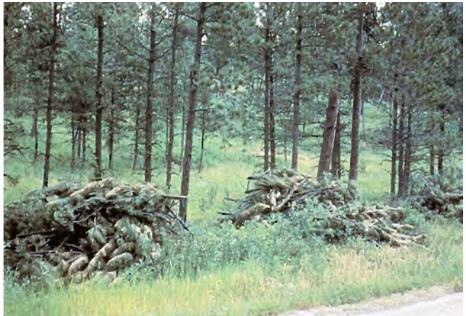
Figure 7. Pine slash susceptible to Ips pini infestation.

Most pine engraver problems are associated with disturbances such as windthrow and snow breakage, drought in spring and early summer, logging, fires, road construction, housing development or other human activities. Pine slash or weakened trees created by these disturbances attract beetles and provide ideal conditions for population buildup and subsequent tree killing (figure 7).