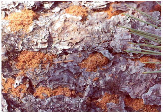
Figure 3. Pine engraver boring dust marking the entry points of beetles.