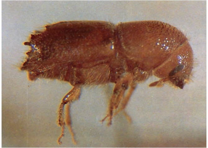
Figure 4. Adult male pine engraver (a "callow" adult). Note prominent posterior declivity and spines.

The adult (figure 4) is cylindrical, about 1/8 to 3/16 inch long, and has four small spines on each side of the elytral declivity at its posterior. The third spine in the male is more prominent than that of the female. A new adult is pale yellow at first (a "callow" adult) but usually turns dark brown or black before flying.