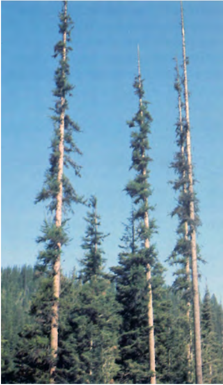
Figure 3— Witches' brooms on heavily infected western larch.

Heavily infested stands typically have many trees with stunted growth, witches' brooms, dying or dead tops, and dead trees. These stands eventually contain numerous dying and dead trees, usually bearing remnants of brooms. Dieback occurs as nutrients and water needed by growing tree tops are diverted to the brooms, which are usually concentrated in the lower or mid crowns. Eventually height growth slows and ceases, foliage above the brooms becomes sparse and off-color, and gradually the tops die. Spike, or staghorn, tops indicate a tree suffering typical decline.