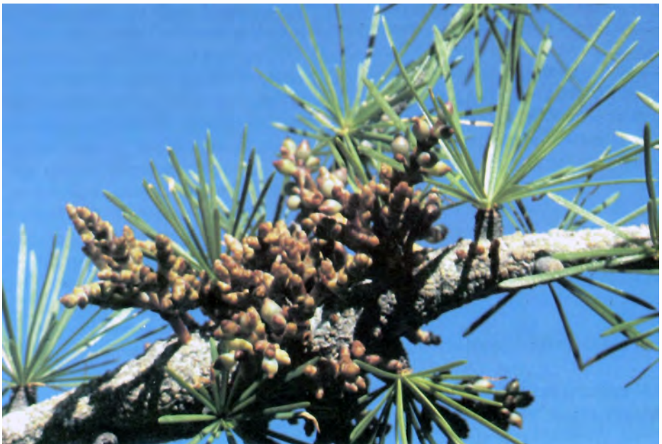
Figure 2— Female shoots of larch dwarf mistletoe.

Heavily infected western larch normally develop many small, dense witches' brooms throughout their crown (figure 3). Because the wood of branches that form brooms becomes extremely brittle over time, witches' brooms often break off during the winter when snow accumulates in the brooms and makes them extremely heavy.