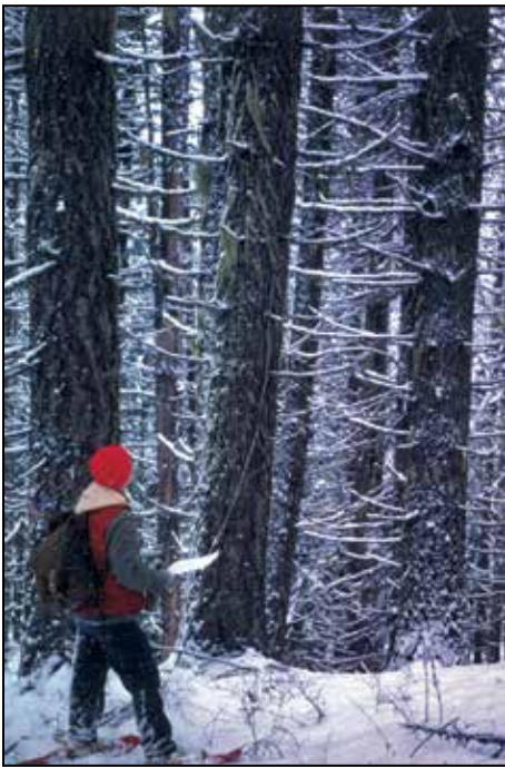
Figure 15. Density and maturity of Douglas-fir affect its susceptibility to beetle infestation. This stand is defenseless should a beetle population be released by events such as wind and ice storms in surrounding stands.