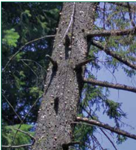
Figure 6. Conks of the pouch fungus form on the outer bark at beetle entrance holes during the year following infestation.

(Pk.) Shear, may form on the outer bark at beetle exit holes of some trees (Figure 6). Various trees in a group may resist attack (Figure 7) and survive while some are intermediate in their resistance. In the latter case, attacks are less dense and although brood