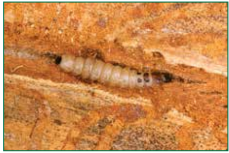
Figure 12. Larva of Temnochila virescens in a tunnel of the Douglas-fir beetle.

they prey on immature broods. Larvae of a predacious fly, Medetera aldrichii Wheeler commonly prey on Douglas-fir beetle larvae. Parasitic wasps augment the array of insects of which the Douglas-fir beetle is a host. A braconid wasp, Coeloides vancouverensis (Dalla Torre) (Figure 13 A, B), is able to sense, apparently by sound, the presence of Douglas-fir beetle larvae hidden from it beneath bark. The length of her ovipositor limits it to larvae in thinner bark, which is more prevalent in the upper portion of infested trunks. This parasite has not been reported yet from Mexico. Of special interest is a pteromalid wasp, Karpinskiella paratomicobia Hagen and Caltagirone, which, in an instant, hops on and off a Douglas-fir beetle on the bark while inserting an egg inside the beetle's ab-