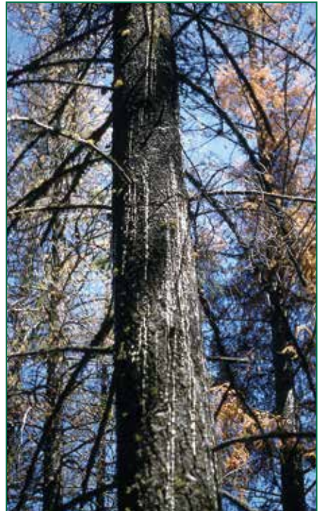
Figure 4. Uppermost attacks sometimes cause pitch to stream downward on the outer bark, aiding in detection of groups of infested trees.

Several months after a tree is infested successfully, its foliage may begin to turn yellowish. At first, the fading appears mottled, involving only some branches as the flow of sap is gradually curtailed. Some trees, however, show no fading until a year after beetle attack. Then, foliage of successfully colonized trees becomes uniformly yellow and finally reddish brown (Figure 5). At this time, conks of the pouch fungus, Cryptoporus volvatus