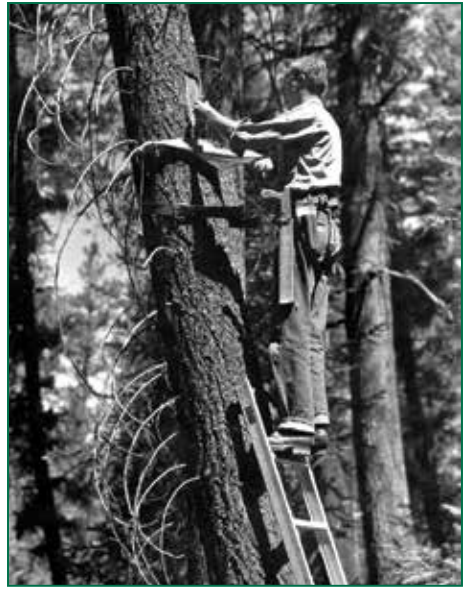
Figure 10. Samples of Douglas-fir beetle brood must be obtained from above a variable basal zone in order to represent the tree's beetle population. In Idaho, such bark samples must be taken at a height of about 12 feet.

Many organisms are associated with the beetle throughout its life cycle. Some, such as mites, nematodes and fungi, are carried by the beetle to a new