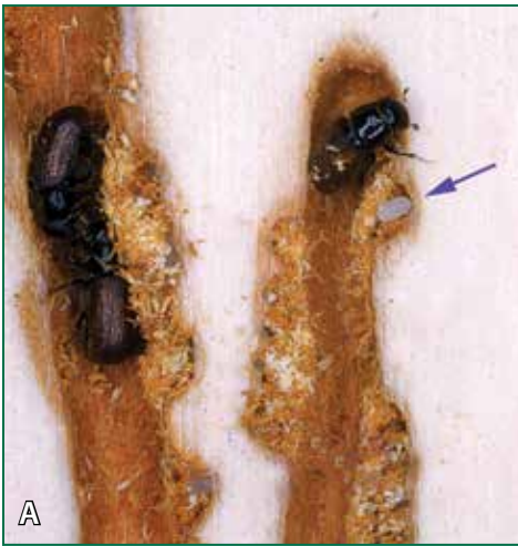
Figure 8. Life stages of the Douglas-fir beetle: A. Parent adults and egg (arrow); B. Larvae; and C. Pupae.