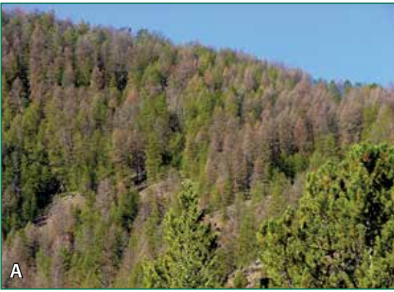
Figure 2 (left). A. In areas such as Wyoming, where Douglas-fir occurs in extensive pure stands, grouping is not evident as shown here during an outbreak in the Shoshone River drainage during 2000-2008. B. Group of beetle-killed Douglas-fir typical of those over much of the distribution of the host and beetle. Such individual groups usually do not extend over a large area but in aggregate may involve thousands of trees.