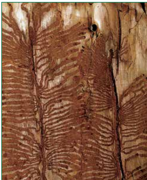
Douglas-fir beetle galleries are distinctive, having eggs laid individually in niches alternating on opposite sides of the gallery.

The Douglas-fir beetle is normally kept in check primarily by resistance of live trees. Under endemic conditions, beetles typically inhabit individual trees or small groups of down or dying trees or