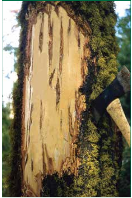
Figure 7. In the Northwest, some attacked trees in a group survive, leaving unsuccessful galleries etched on the live sapwood.

establishment is mostly unsuccessful, the beetles succeed in inoculating the trunk with the pathogenic fungus, Ophiostoma pseudotsugae (Rumb.) von Arx. These trees of intermediate resistance fade a year later than others in a group, and are often mistaken for newer attacks.