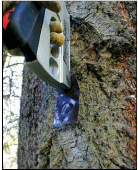
Figure 16. Bubble cap containing MCH applied to the trunk protect susceptible, high value, individual Douglas-fir from attack by the Douglas-fir beetle.