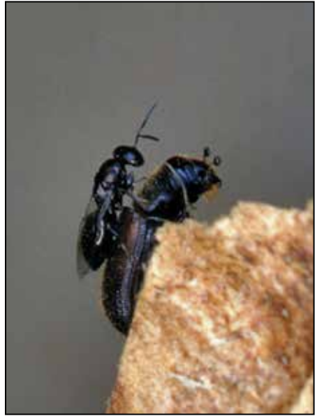
Figure 14. Another wasp, Karpinskiella paratomicobia , inserts her egg in an instant into the abdomen of a Douglas-fir beetle.

Smaller, more obscure organisms that accompany the beetle from tree-to-tree include fungi, nematodes and mites. Ascospores of the tree pathogenic fungus, O. pseudotsugae , are carried on the beetle's exoskeleton. In susceptible trees, this fungus invades and clogs the sapwood cells thereby stifling their ability to conduct nutrients vital to the life of the tree and contributing to survival of beetle offspring. Nematodes of several species occur externally in pods under beetle elytra and internally in their abdomen. These do not seem to have much harmful effect, with the exception of the large adult Parasitaphelenchus reversus (Thorne) which, by their activity in a beetle's abdomen, may reduce fat reserve and possibly fecundity. Other hitch-hikers include several species of mites that cling to inter-segmental spaces of beetle abdomens, under the elytra, or attached to a leg by a pedicel. Most are scavengers, fungivorous, or feed on nematodes, and do not appear to be detrimental except possibly by interfering with flight when occurring at high density on occasional beetles.