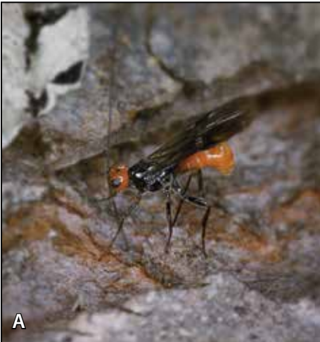
Figure 13. A. Hidden Douglas-fir beetle larvae are detected by a wasp, Coeloides vancouverensis , which inserts her egg through the bark to parasitize them. B. Victims are marked by cocoons of the wasp at the ends of beetle larval mines.

ico. Also included among the predacious beetles is Temnochila virescens (Mann.). Adults of these beetles prey on the Douglas-fir beetle during its exposure on the bark before tunneling to safety; their larvae, however, are able to penetrate galleries (Figure 12) where