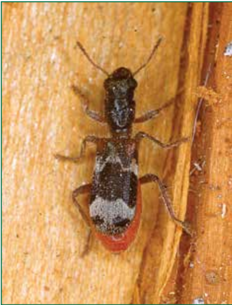
Figure 11. A gravid female, Thanasimus undatulus , a common predator of the Douglas-fir beetle.

ico. Also included among the predacious beetles is Temnochila virescens (Mann.). Adults of these beetles prey on the Douglas-fir beetle during its exposure on the bark before tunneling to safety; their larvae, however, are able to penetrate galleries (Figure 12) where