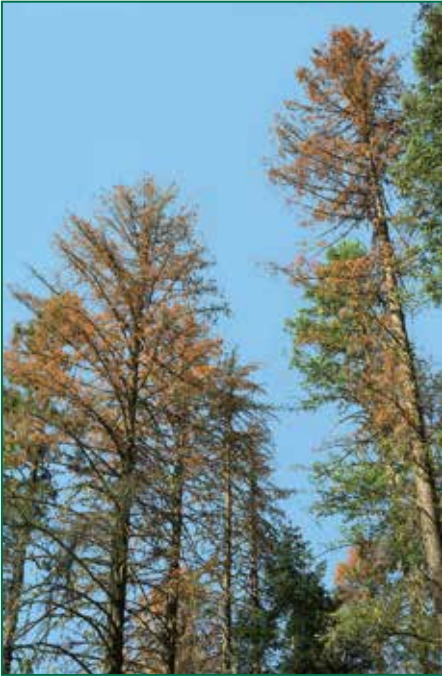
Figure 5. Foliage of infested trees turns reddish brown during the following summer; needles are mostly shed by the second year.

(Pk.) Shear, may form on the outer bark at beetle exit holes of some trees (Figure 6). Various trees in a group may resist attack (Figure 7) and survive while some are intermediate in their resistance. In the latter case, attacks are less dense and although brood