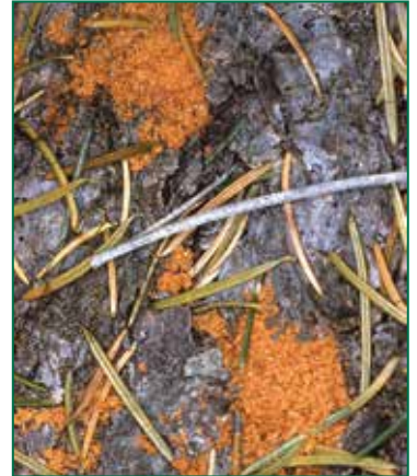
Figure 3 (below). Frass expelled from the entrance of beetle galleries.

crevices to determine if beetles are present. Sometimes, an infestation is signaled by streams of clear resin that flow downward from beetle entrance holes near the top of the infested portion of the trunk (Figure 4).