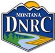
EXHIBIT # C