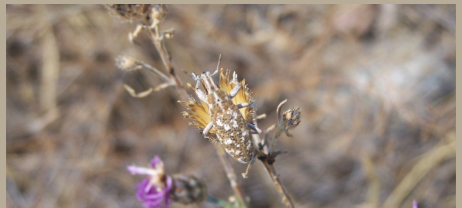
An Insect Used for Spotted Knapweed Biological Control

For educational resources on addressing invasive weeds contact: