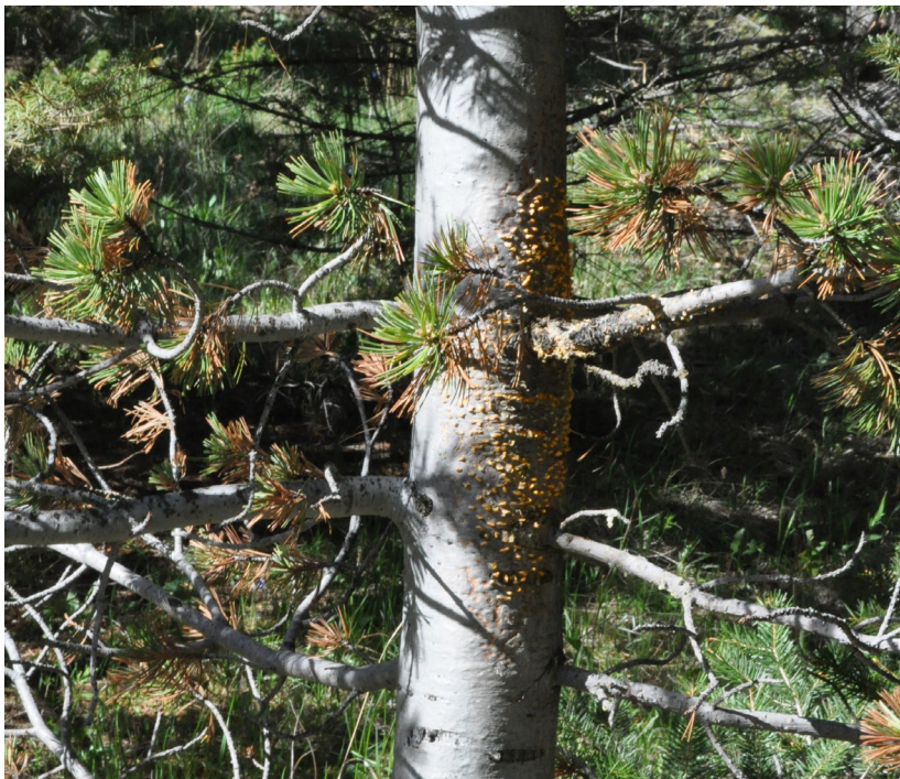
White pine blister rust canker on limber pine