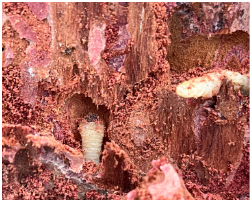
Wood borer larvae in larch