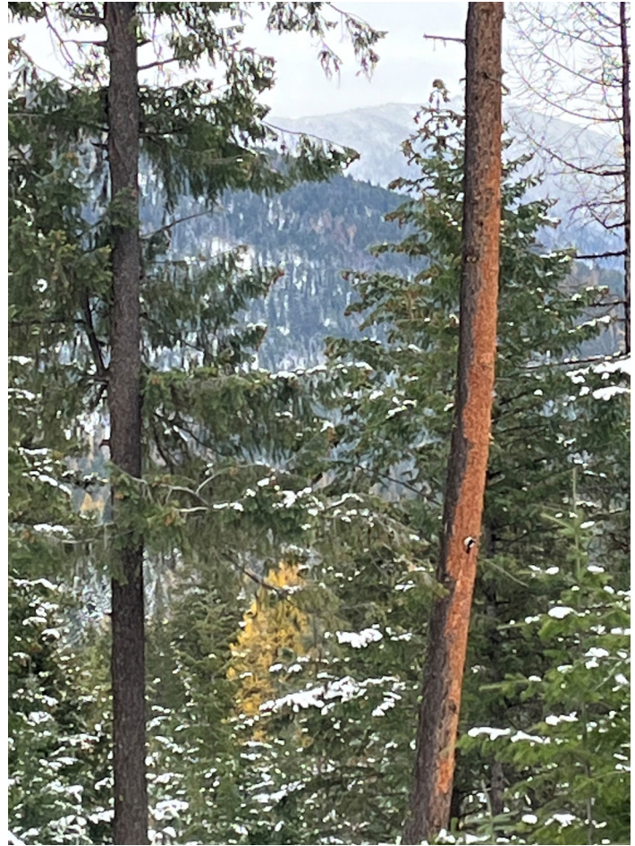
Wood borers in western larch

Wood borers and secondary beetles were observed in pole-sized and mature Douglas-fir near Helena, with abundant woodpecker activity on infested trees.