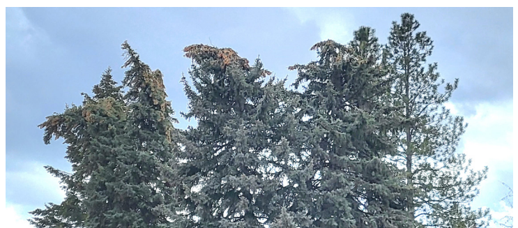
Wilted Spruce Tops