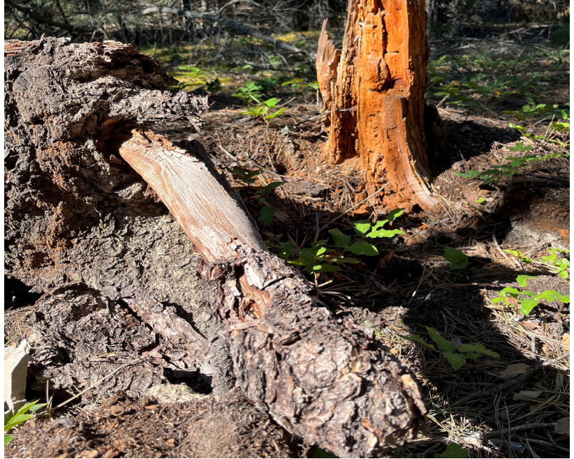
Schweinitzii cubicle rot and clubbed root

Bark beetles, particularly Douglas-fir beetle and fir engraver, commonly attack trees that are infected with root disease. Root diseases can interact with drought to make trees more susceptible to bark beetles and to amplify the impact of other damage agents.