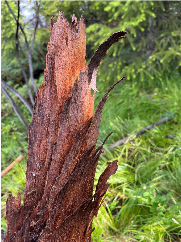
Laminated root disease in Douglas-fir