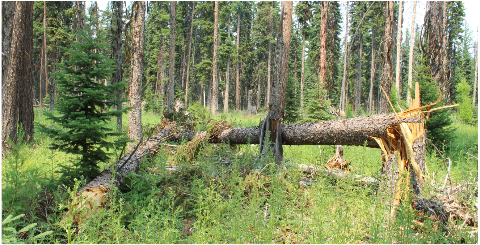
Blowdown in Stillwater State Forest

Montana's diverse landscape includes approximately 26 million acres of forested land, most of which is located west of the continental divide. Forests are primarily composed of Douglas-fir, ponderosa pine and lodgepole pine with smaller components of western larch, true fir species and spruce. Forest health issues commonly ebb and flow as populations of pests outbreak in response to triggering events such as storms, wildfire and drought.