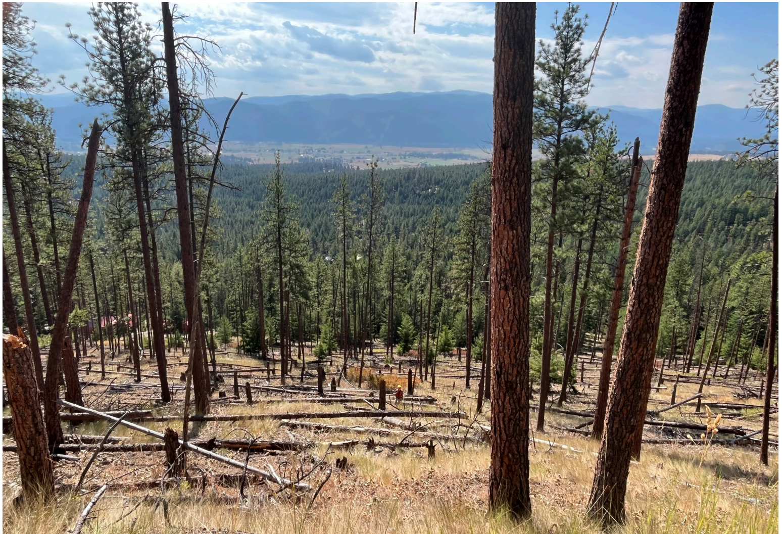
Ponderosa pine stand impacted by black pineleaf scale