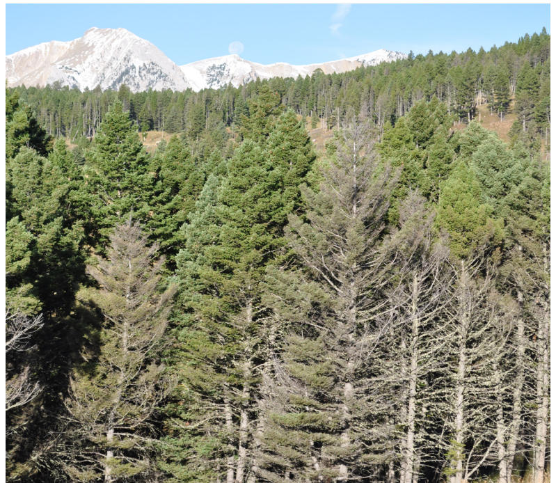
Douglas-fir defoliated by western spruce budworm

Western spruce budworm, Choristoneura freemani , was mapped on 34,288 acres with concentrated activity near Hebgen Lake, Yellowstone National Park and Custer-Gallatin National Forest. Heavy populations near Stemple Pass (Lewis and Clark County) spilled over into inter-mixed stands of lodgepole pine.