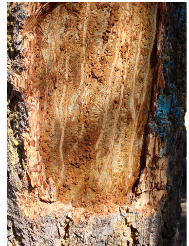
Douglas-fir beetle galleries