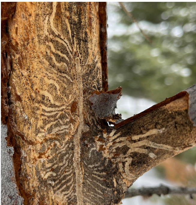
Secondary engraver beetles in Douglas-fir