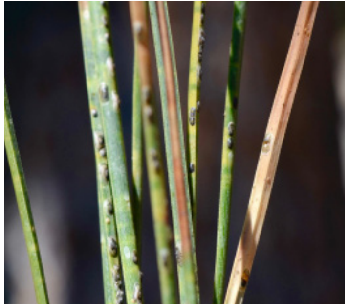
Black pineleaf needle scale

In 2015, black pineleaf scale was detected on 104 acres in Houle Creek near Frenchtown. As of 2022, severe mortality has occurred across much of the stand including mature ponderosa pine. Ground plots established by USFS in the infestation yielded high mortality rates associated with western pine beetle, mountain pine beetle and pine engraver beetles. The outbreak is estimated to have originated in 2012 and has had pulses of mortality, especially during the hot, dry summer of 2017.