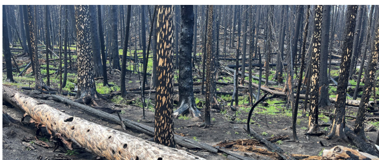
Fire in the Pioneers

Impacts of drought can manifest in what may initially appear to be an insect or disease outbreak, yet the actual stressor is the underlying lack of moisture. This complex is particularly common with bark beetles and wood borers attacking trees that are otherwise stressed. Trees can survive with disease infection, but begin to succumb when overall tree vigor is compromised by drought.