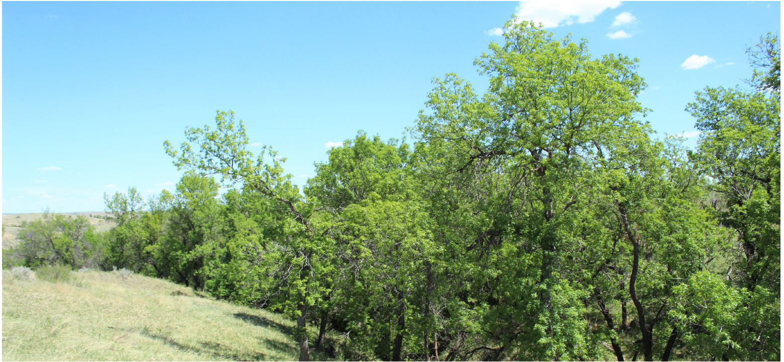
Recovered green ash stand in eastern Montana after multiple years of fall cankerworm defoliation

Green larch looper, Macaria sexmaculata , was recorded on 126 acres in Lincoln and Sanders Counties with damage becoming apparent by late August and into September. At the same time, larch needle disease had increased substantially (9-fold from 2021-2022) and likely obscured defoliation from green larch looper. Larval sampling indicated low synchrony in larval instars with a later pupation timeframe than currently suggested in the literature. October sampling still included larvae.