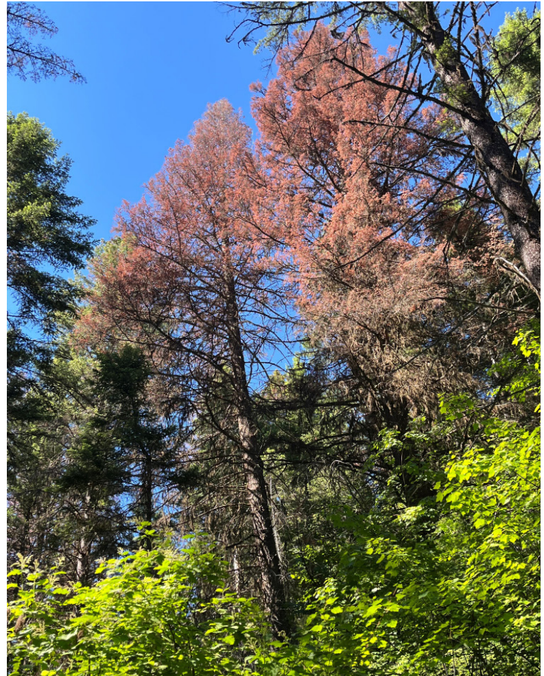
Patch of Douglas-fir beetle mortality

Aerial survey noted pine engraver beetles, Ips species, on approximately 2,300 acres however, outbreaks can be quite localized and associated with specific management activities. Outbreaks notably increased in some counties (Choteau +151%, Flathead +56%, and Lewis and Clark +2225%) whereas activity substantially decreased in others (Lincoln -28%, Missoula -61%, Fergus -88% and Lake Co-98%). Blowdown events in early 2021 near Thompson Falls provided host material for rapid expansion of populations and ultimately resulted in green tree mortality and top-kill of mature ponderosa pine.