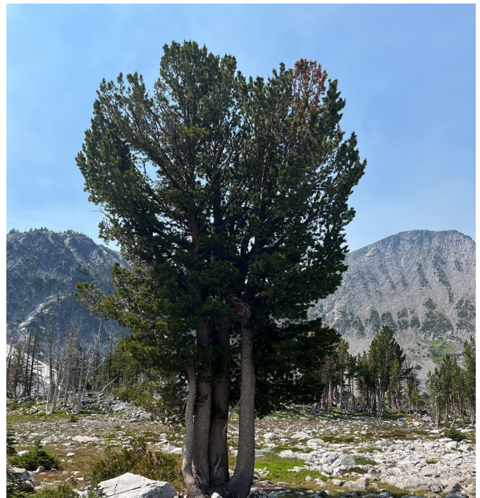
Mature whitebark pine

For paper copies or additional information, please contact the DNRC Forest Pest Management Program at 406-542-4300. In accordance with Federal law and U.S. Department of Agriculture policy, this institution is prohibited from discriminating on the basis of race, color, national origin, sex, age, or disability. (Not all prohibited bases apply to all programs.) To file a complaint of discrimination, write USDA, Director, Office of Civil Rights, Room 326-W, Whitten Building, 1400 Independence Avenue, SW, Washington, DC 20250-9410 or call (202) 720-5964 (voice and TDD). USDA is an equal opportunity provider and employer.