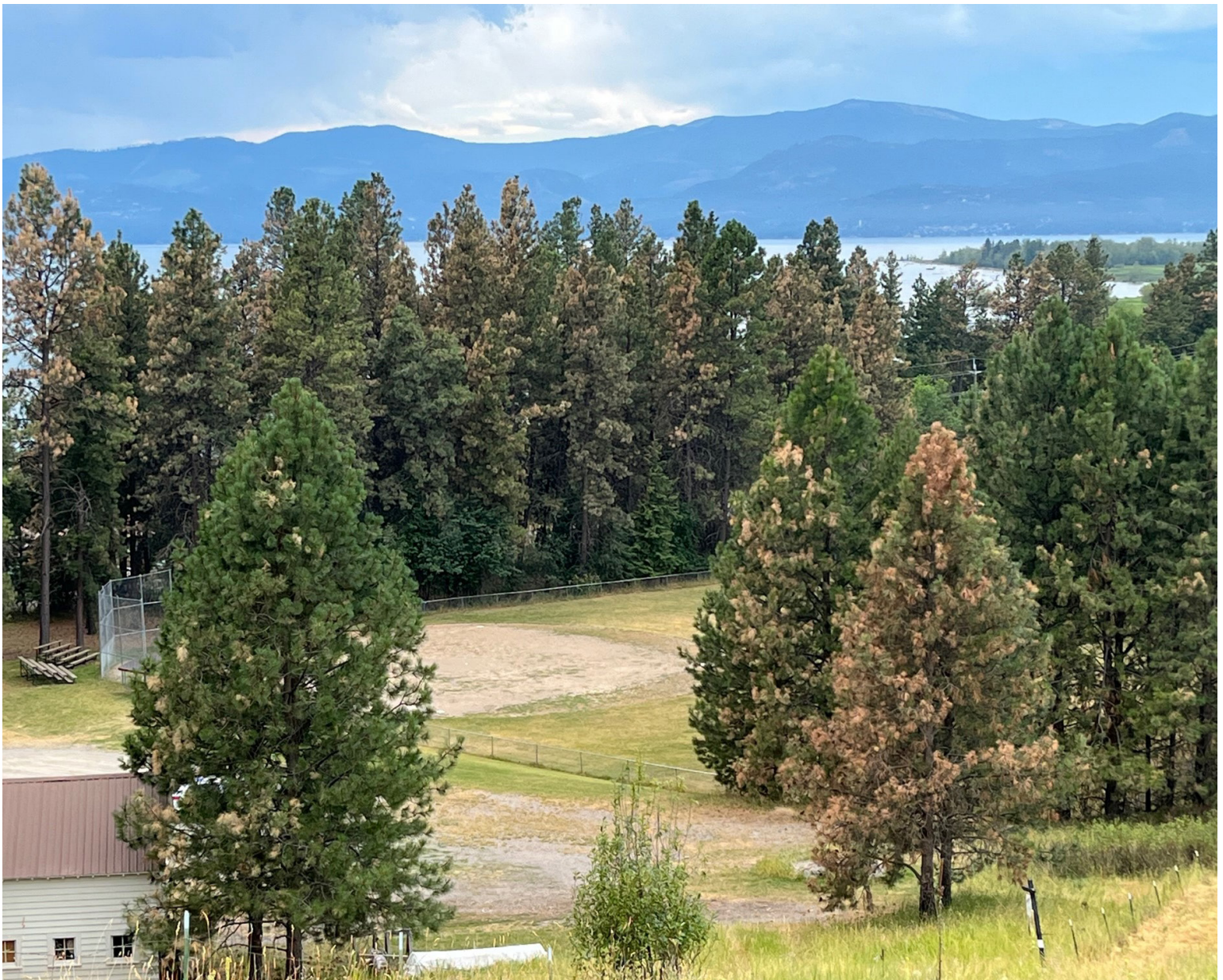
Diplodia outbreak in Bigfork