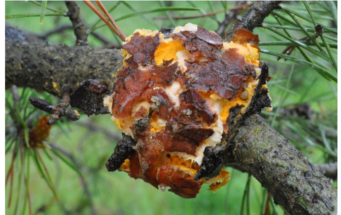
Sporulating western gall rust on pine

Diplodia, Diplodia pinea , and western gall rust, Endocronartium harknessii , have been chronic in western Montana, leading to branch flagging throughout crowns of ponderosa pine. A localized, severe outbreak of Diplodia was triggered by a hailstorm in July near the northeastern shore of Flathead Lake and spanned across Woods Bay, Bigfork and Echo Lake, with many ponderosa pine suddenly cast in bright orange. Outbreaks are common when hail creates wounds that allow latent Diplodia infections to become symptomatic. Diplodia does not typically kill the entire tree unless stressed by other factors such as drought or bark beetles. Drought also exacerbates western gall rust impacts and may have contributed to the observed decline of heavily infected mature ponderosa pines in the region.