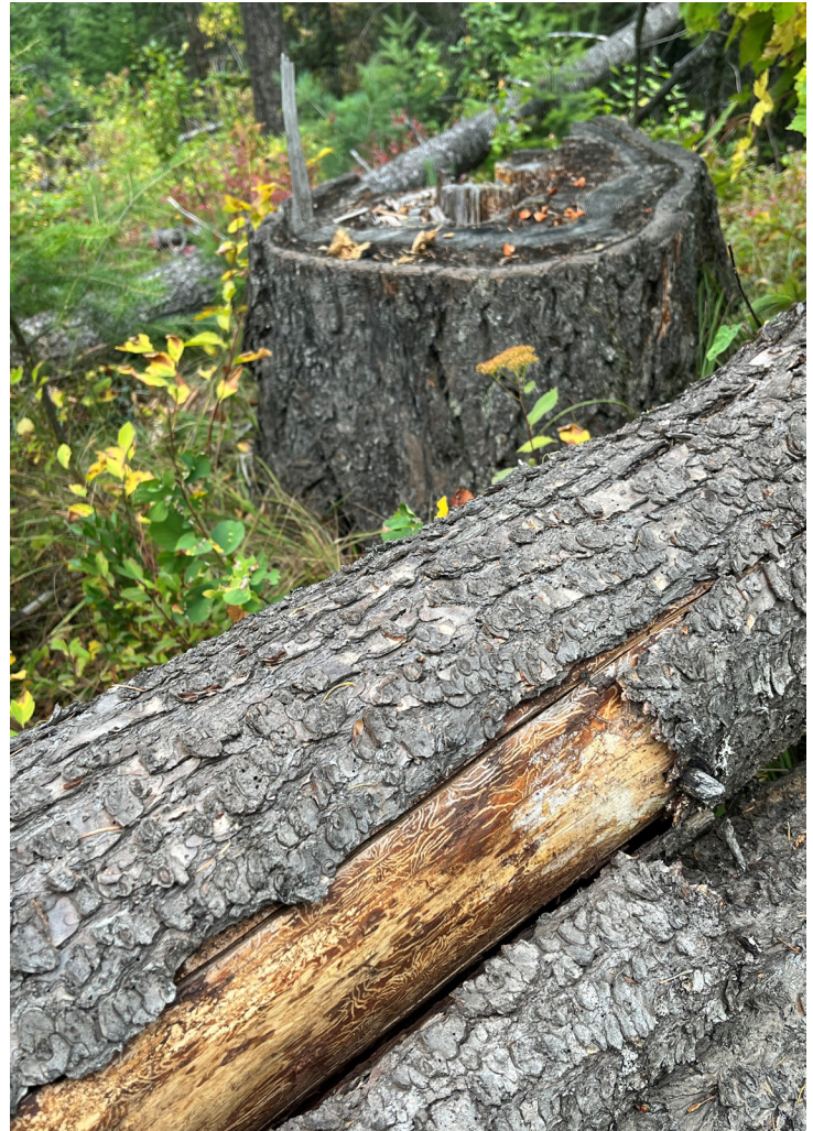
Secondary bark beetle attacks in diseased stand