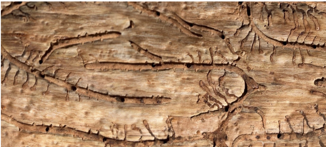
Ips gallery in pine