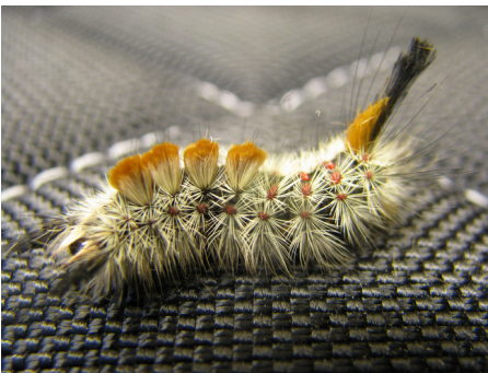
DFTM caterpillar (larva)