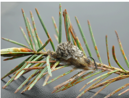
DFTM pupal case