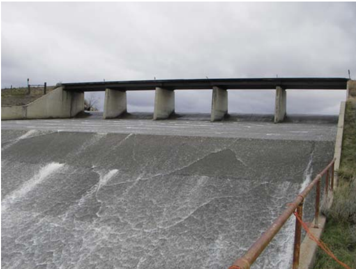
Spillway and county road bridge