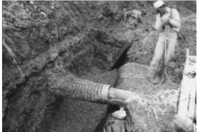
Installing diaphragm filter around slip-lined pipe on Dogget Dam

Doggett Dam , located in Meagher County, just west of White Sulphur Springs, recently underwent outlet pipe rehabilitation. The existing pipe was slipped lined with a high-density polyethylene liner pipe. The project also included the installation of a new gate, trashrack, and downstream filter. Next year, the addition of a stability berm and toe drain will be considered. The dam is owned by the Camas Creek Cattle and Sheep Company. The engineer on the project is Lewis Burton and Associates of Belgrade, Montana.