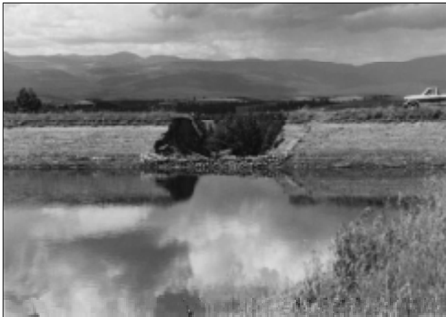
Eureka Wastewater Impoundment Dam (Lincoln County)

The Department of Natural Resources and Conservation (DNRC) Dam Safety Program is responsible for regulating over 90 high-hazard dams. To be classified as high-hazard, a probability of loss of life in the event of a dam failure must exist. The owner of each high-hazard dam is responsible for developing an emergency action plan to be used as a response guideline if the dam fails or sustains damage.