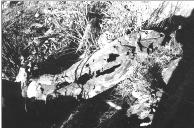
Abandoned outlet conduit removed from Tin Cup Dam (Powell County)

Tin Cup Lake Dam , located on the State Prison Ranch in Powell County, is currently being rebuilt after an abandoned outlet pipe was removed from the dam. The abandoned pipe went undetected for several years, due to thick vegetation on the downstream side of the dam. Everyone was shocked upon seeing the condition of the old pipe, once it was removed! The rehabilitation also includes considerable embankment work such as the addition of stability berms, chimney drains, and toe drains. The engineer on the project is Portage Engineering, of Helena Montana. □