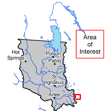
Flathead Indian Reservation