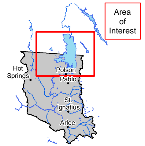
Flathead Indian Reservation