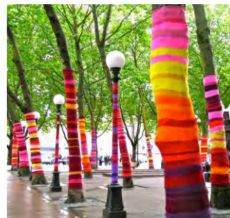
"Sweater Trees"

Population Determination: The July 1, 2012 population as found in the U.S. Bureau of the Census 2012 Annual Estimates of Population for Cities and Towns will be used to determine the population category for award purposes. The population figures can be found under the Montana link here: U.S. Census data