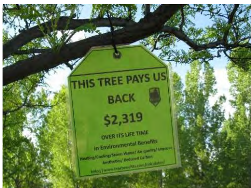
Price tags on community trees in Billings

Please provide project photos when available.