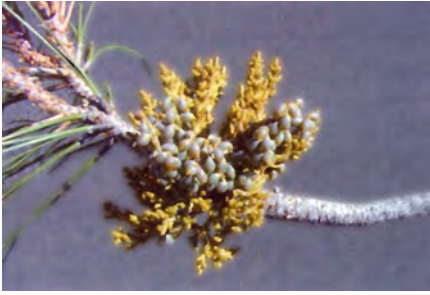
Figure 2. Mature fruit and female shoots of gray pine dwarf mistletoe

branches they leave behind small cup-like structures embedded in the bark. These are called basal cups. Infected branches typically do not develop into masses of branches called witches' brooms like those caused by many other dwarf mistletoes (Figure 3).