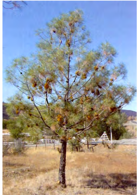
Figure 3. Severely infected gray pine. Note that dense masses of branches known as witches' brooms are not formed on gray pine.

Dwarf mistletoes can adversely affect other forest values. Dead branches can increase the hazard potential in recreation sites because they may break and fall. Dead and dying trees detract from visual quality.