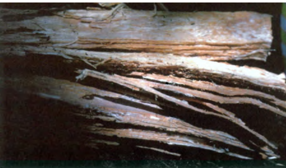
Fig. 6. Typical laminated advanced decay caused by H. annosum .

A light, tawny-brown colored fungal growth may be found on the exteriors of infected roots of pines, true firs, and Douglas-fir (fig. 4). This serves as the primary mechanism for root to root spread, growing along the surface of roots and moving onto the roots of adjacent trees across contacts and grafts. Some other root disease fungi form similar mycelia, and its occurrence alone cannot be used to diagnose the disease.