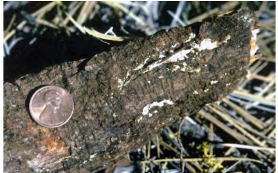
Fig. 2. Characteristic buff-colored pustules that form on the exterior of H. annosum -infected roots.

true fir, and ponderosa pine stumps and roots (fig. 3) or under the bark of decaying pine stumps. Fully mature fruiting bodies may be 10 inches (25 cm) across or larger. H. annosum conks have a buff to dark brown-colored upper surface with concentric furrows and a smooth, cream-colored under surface that has tiny pores and a narrow sterile (non-pored) margin. Conks are perennial and may have more than one tube layer.