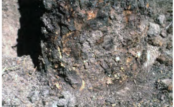
Fig. 1. Small button conks of Heterobasidion annosum on the root collar of a ponderosa pine. Note: these were formed below the duff layer, which was removed for this photograph.

Large conks often grow in the interiors of hollow or extensively decayed hemlock,