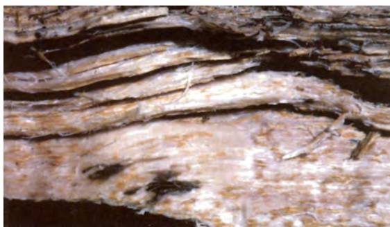
Fig. 7. White streaks and black flecks throughout wet spongy advanced decay most often found on H. annosum -infected grand fir, Douglas-fir or hemlock.