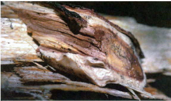
Fig. 5. Characteristic red stain in the interior of a live H. annosum -infected grand fir root.