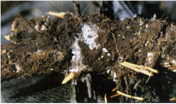
Fig. 4. Ectotrophic mycelia on the exterior of an infected root.