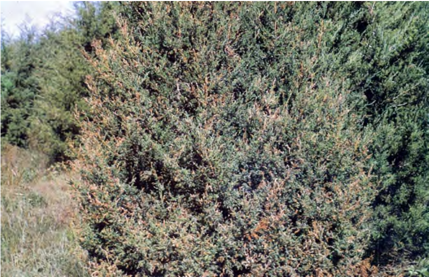
Figure 3. —Dead branch tips on eastern red-cedar caused by Phomopsis juniperovora .

Recently, Kabatina juniperi Schneider & v. Arx has become a problem in juniper outplantings and in production of grafted junipers.