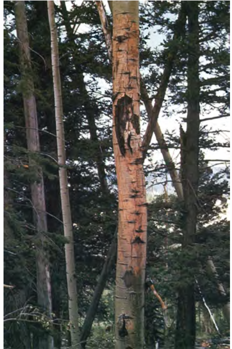
Figure 5 – Cryptosphaeria canker exhibiting the typical snakelike pattern of infection.

Flask-shaped fruiting bodies, called perithecia , develop beneath bark dead for more than 1 year. The perithecia release spores during wet periods. These spores colonize wounds, establishing the fungus at a new site. Light-orange-colored fruiting structures, called acervuli , of the asexual state of the fungus ( Libertella sp.) are occasionally found along the edges of the canker.