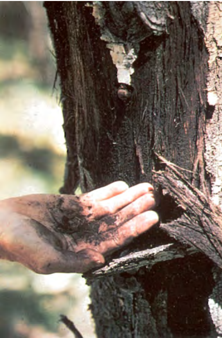
Figure 2 – Sooty residue from infected bark tissue.

Sooty-bark canker: Sooty-bark canker, the most lethal canker on aspen in the West, is considered the most serious, for it tends to occur on the larger trees on all sites. It is found mainly on overmature trees (over 120 years old) but can kill all sizes, usually within 3 to 10 years. Cankers are most common in stands where the incidence of wounding is high.