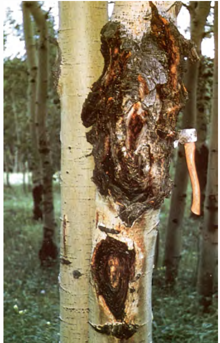
Figure 7 – Black canker showing large callus folds.