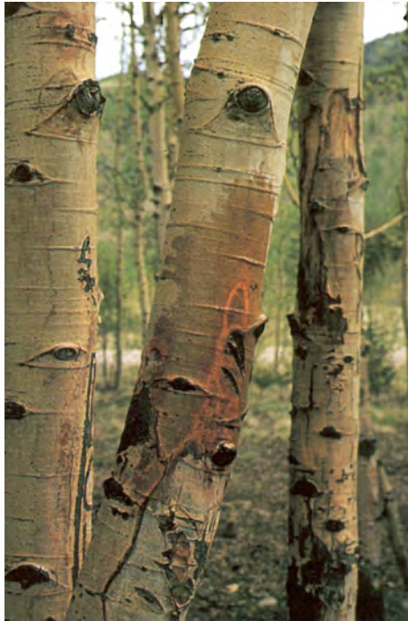
Figure 8 – Cytospora canker showing irregular pattern of infection and orange discoloration of bark tissue.

The first indication of infection is the orange discoloration of the bark surrounding the wound. After infection,