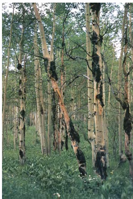
Figure 1 – Aspen stand with trees damaged by black canker.

Aspen reproduces primarily by means of root suckers produced from buds on shallow roots. Over much of its western range, quaking aspen is a small to medium-sized, fast-growing, and generally short-lived tree. The species reaches its most splendid development in the Rocky Mountains of southern Colorado and northern New Mexico, where some individual trees can attain diameters of up to .9 m (3 ft) and a height of 30.5 m (100 ft), and often live for more than 150 years. However, average trees are considerably smaller and many stands begin to deteriorate after 80 years.