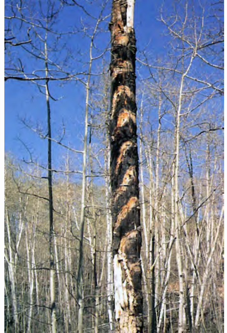
Figure 3 – Sooty-bark canker exhibiting characteristic barber pole pattern of infection.

The fungus infects trees through wounds and invades the inner bark and cambium. Cankers develop rapidly, extending as much as 1 m (3 ft) in length and .3 m (1 ft) in width in a year. However, the mean annual extension vertically is .4 m (18 in) and .2 m (6 in) horizontally. Young cankers first appear on the bark as sunken oval areas. Formation of callus around canker margins is unusual, as host tissues are rapidly colonized by the fungus. The bark killed each year by the fungus is readily apparent and begins to slough after 2 or 3 years, exposing the blackened inner bark. This dead inner bark, which crumbles to a soot-like residue in one's hand, is the origin of the common name of this canker (figure 2). The outer bark sloughs faster in the central portions, giving the canker a “barber pole” appearance (figure 3). Eventually the bark falls off in long stringy strips,