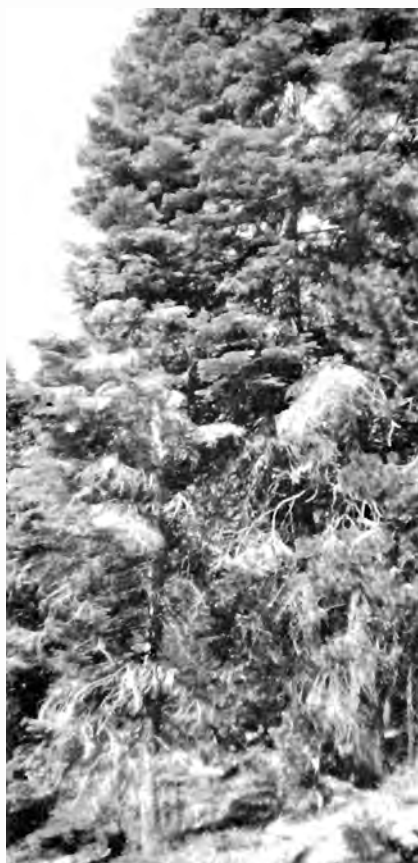
Figure 2.—Top of this pole size white fir was killed by Cytospora abietis .