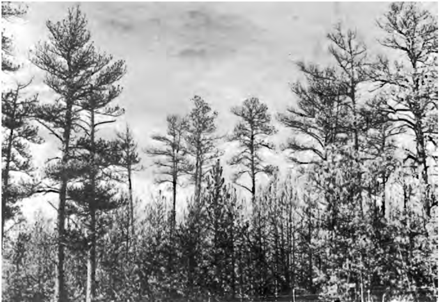
Figure 1.—Windthrown longleaf pines provide host material for population buildup and subsequent invasion of standing trees by Ips calligraphus .