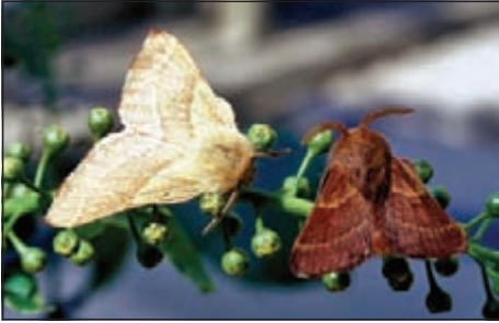
A - Two adults showing variation in wing color.