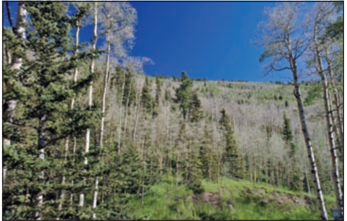
Figure 3 – Heavy defoliation of a quaking aspen stand by western tent caterpillar.