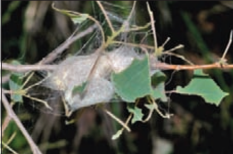
E - Cocoons on branches of quaking aspen in various stages of development.