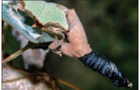
F - Pupal case following emergence of adult.

by a blue-white to pale blue dash on each body segment. The mid dorsal stripe is edged with two bands that may be black, or yellow - orange banded with black. The body is covered with orange or orange - brown hairs with white tips (Fig 6 C-D).