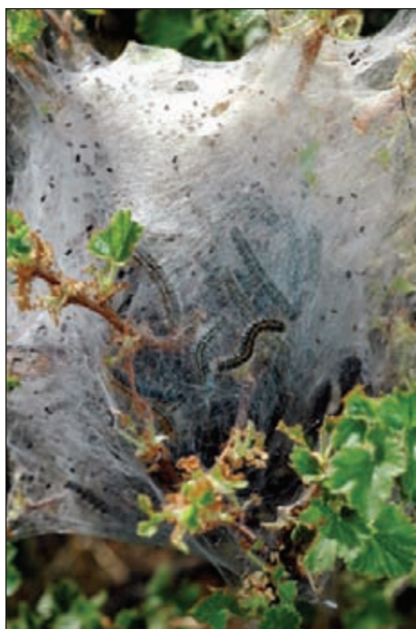
Figure 1 – Western tent caterpillar “tent” and larvae on wild currant.

The western tent caterpillar, Malacosoma californicum (Packard) (Lepidoptera: Lasiocampidae), is a defoliator of broadleaf trees and shrubs throughout much of the western United States, southern Canada and parts of northern Mexico (Fig. 1). This insect is the widest ranging and most variable of the North American species of Malacosoma . Six subspecies and several unclassified forms are recognized. Three subspecies: M. californicum californicum (Dyar), M. californicum ambisimile (Dyar), and M. californicum recenseo (Dyar) have localized ranges in California. M. californicum pluviale is found in the Pacific Northwest and across Canada from southern British Columbia east to western Quebec. Isolated populations of this subspecies have also been found in Minnesota, New Hampshire and New York. M. californicum lutescens is found in the Great Plains from eastern Montana south to Oklahoma and Texas and in the Prairie Provinces of Canada. M. californicum fragile is found in the southwestern U.S. A “central” population, simply known as M. californicum , is known from eastern Oregon and Washington, southern Idaho, Wyoming and the southwestern U.S. Western tent caterpillar is also known from three states in northern Mexico: Chihuahua, Coahuila and Durango (Fig. 2).