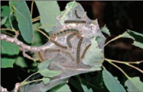
C - Larval colony on tent. Note variation in color and patterns on the larvae.