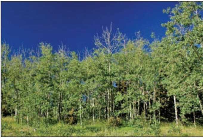
Figure 7 – Top kill in quaking aspen following several successive years of defoliation by western tent caterpillar.

Successive years of defoliation of aspen, red alder and other host trees can cause reduced diameter growth, branch dieback and top kill, reduced production on fruit trees and, in some cases, tree mortality (Fig. 7). Choke cherry fruit is an important food source for some indigenous cultures. It is also used as a food