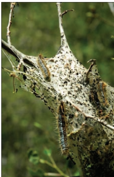
Figure 8 – Western tent caterpillar killed by a nuclear-polyhedrosis virus.

A nuclear polyhedrosis virus (NPV) infects the larvae and has been known to cause the collapse of outbreaks. Larvae killed by NPV typically hang from branches or nests, head down or in an inverted “v” shape, and have a wilted appearance (Fig. 8).