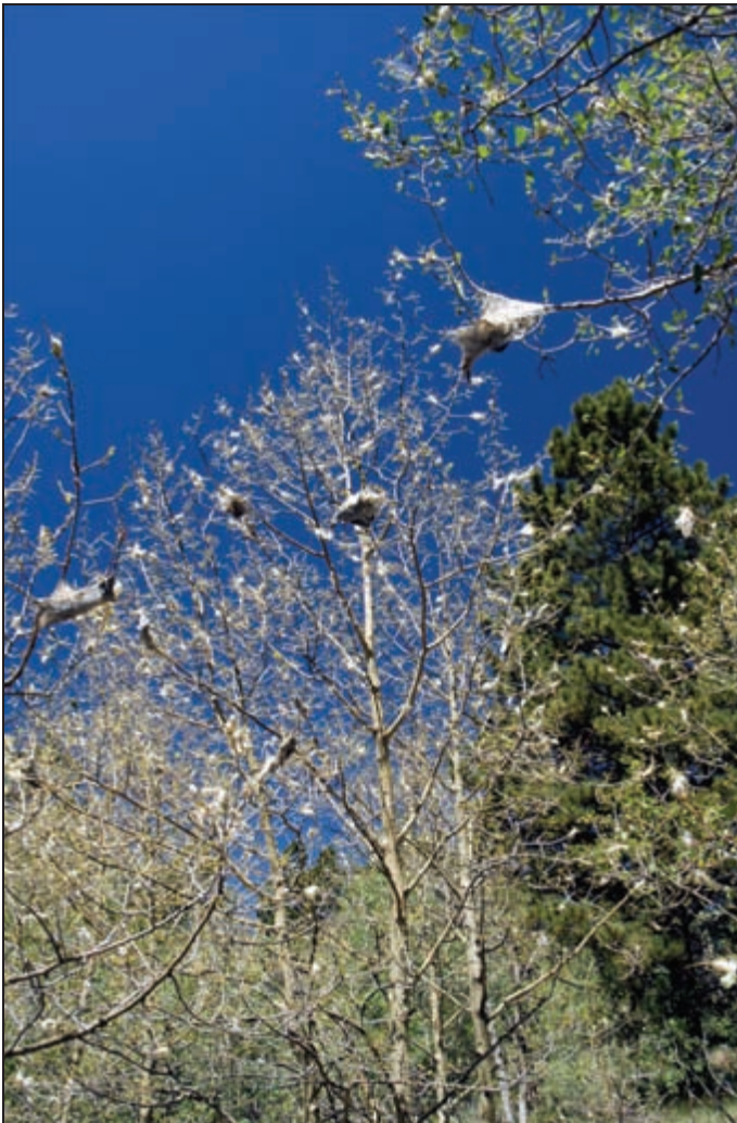
Figure 5 – Tents and cocoons of western tent caterpillar in heavily defoliated quaking aspen.

When first hatched, the larvae are about 1/8 inch (0.31 cm) long, dark brown to black in color with whitish hairs. Mature larvae are 1 ¾ to 2 inches (4.45 – 5.08 cm) long and highly variable in color and markings. Most larvae have a pale blue head capsule and body, speckled with black markings. They have a mid-dorsal stripe formed