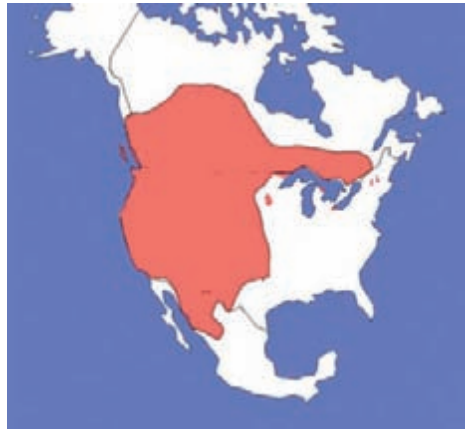
Figure 2 – Approximate distribution of western tent caterpillar and its subspecies in North America

Woody shrub hosts of western tent caterpillar include: bitterbrush, ( Purshia tridentata ), mountain mahogany, ( Cercocarpus ledifolius ), Ceanothus ( Ceanothus spp.), ninebark ( Physocarpus spp.), three-leaf or skunkbush sumac ( Rhus trilobata ), wild currant ( Ribes spp.) and wild rose ( Rosa spp.).