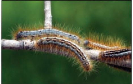
D - Mature larvae.