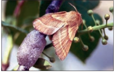
B - Female adult and egg mass (Photo by J.E. Dewey, USDA Forest Service R-1 [retired]).