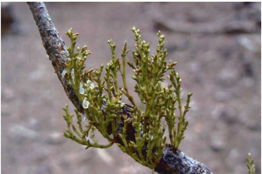
Figure 2. Female plants of sugar pine dwarf mistletoe.

Dwarf mistletoes are small, seed-bearing parasitic plants. The external (aerial) shoots of sugar pine dwarf mistletoe are yellow to yellow-green and have their leaves reduced in size to small scales. The shoots are perennial and usually about 3-4 inches (7-10 cm) long (Figure 2). The shoots of western white pine dwarf mistletoe