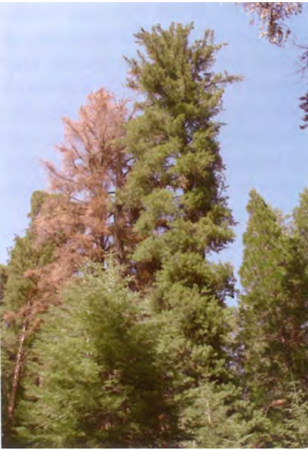
Figure 4. Witches' brooms associated with severe infection by sugar pine dwarf mistletoe on sugar pine. The dead tree on the left was also infected with sugar pine dwarf mistletoe and was killed by mountain pine beetles.

in these brooms have several mistletoe plants on them. In severely infected pines, witches' brooms often encompass most of the tree's foliage and represent a significant drain on the tree's vigor.