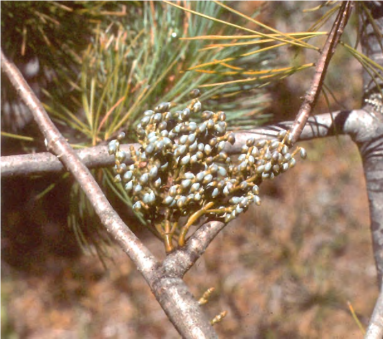
Figure 3. Female plants of western white pine dwarf mistletoe. The fruits on this plant are nearly mature.

are typically dark brown and about 2-4 inches (5-10 cm) long (Figure 3). Aerial shoots arise from a network of root-like strands embedded in host branches. This network, called the endophytic system, consists of two parts: 1) cortical strands growing longitudinally in the bark, and 2) sinkers growing radially in the wood. The endophytic system absorbs nutrients and water from infected branches, and will usually continue to live as long as infected host tissue remains alive. Dwarf mistletoes are dependent upon their host tree for water, minerals, and carbohydrates. Although the aerial shoots do contain some chlorophyll which allows them to produce small quantities of carbohydrates through photosynthesis, the principal function of aerial