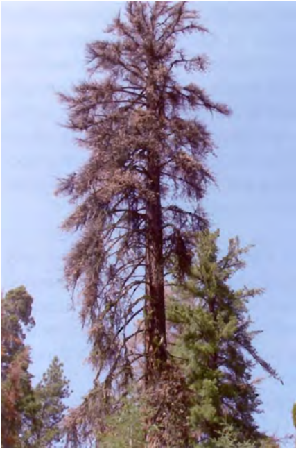
Figure 5. Dead, mature sugar pines severely infected with sugar pine dwarf mistletoe and killed by mountain pine beetle in the Sierra Nevada Mountains. Note the numerous, large witches' brooms scattered throughout the crown of this dead tree.

and each third rated as: 0 = no visible infection, 1 = light infection (less than half of the branches in the crown third have dwarf mistletoe infections), or 2 = severe infection (more than half of the branches in the crown third have infections). The three ratings are then added to obtain a tree rating. The tree ratings of all live trees (including uninfected ones) are then averaged to obtain a stand or plot rating. The 6-class DMR system has been used since the late 1950s and is the standard protocol in the U.S., Canada, and Mexico for assessing severity of dwarf mistletoe infection on individual trees and within stands.