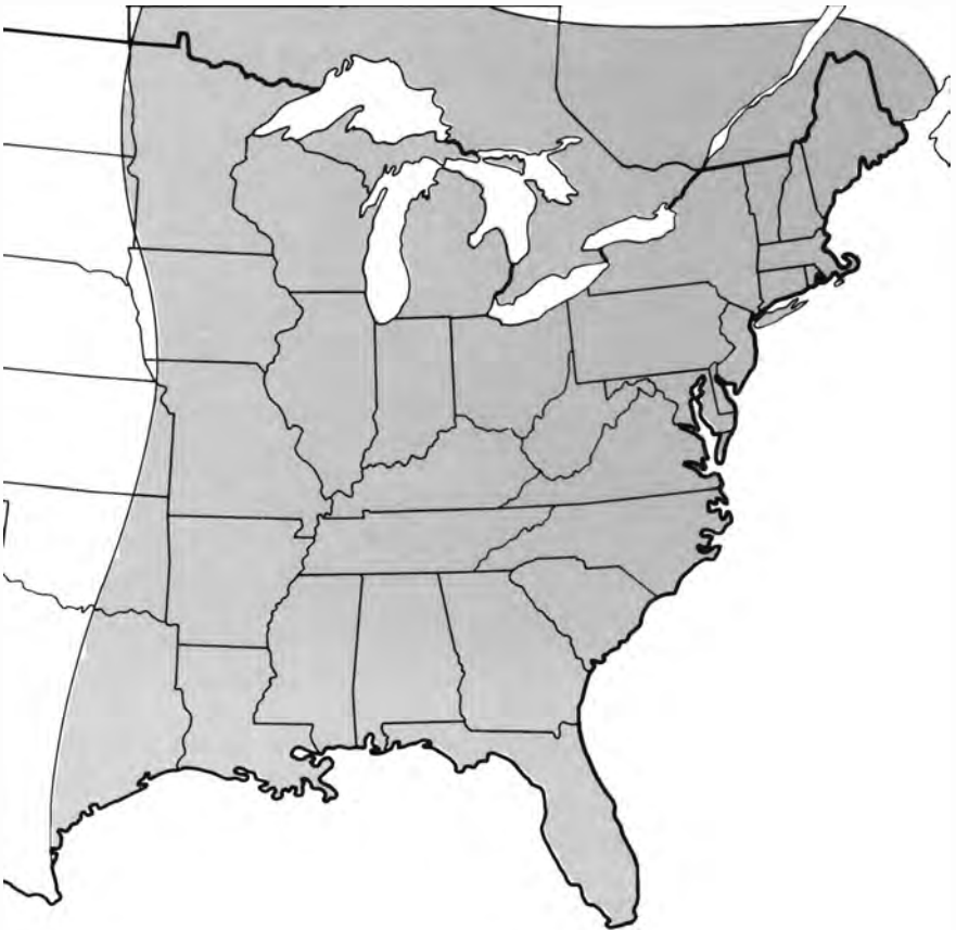
Figure 1.—Range of pales weevil.

In eastern North America, pales weevil has been recorded feeding on most native and several exotic con-