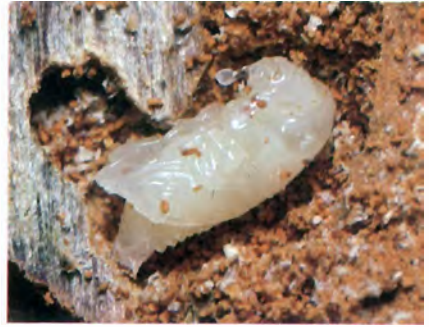
Figure 6—Pupa of California fivespined ips .

Late summer or fall attacks produce a partial generation that overwinters under the bark of trees or slash as mature larvae, pupae, or adults (fig. 7).