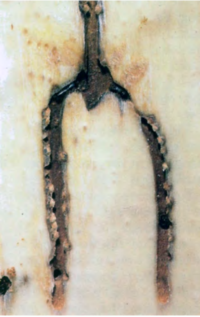
Figure 3 —A typical egg gallery with its three branches.