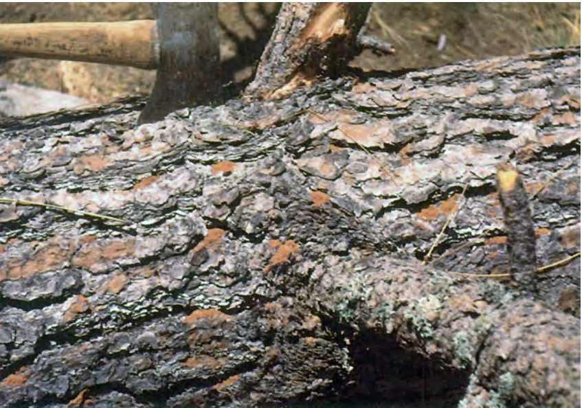
Figure 2 —Boring dust on slash.

It attacks the following native pines: ponderosa, sugar, Coulter, western white, lodgepole, Jeffrey, Digger, knobcone, Monterey, and bishop pines. It also attacks knobcone X Monterey hybrid pines and probably other pines introduced in-