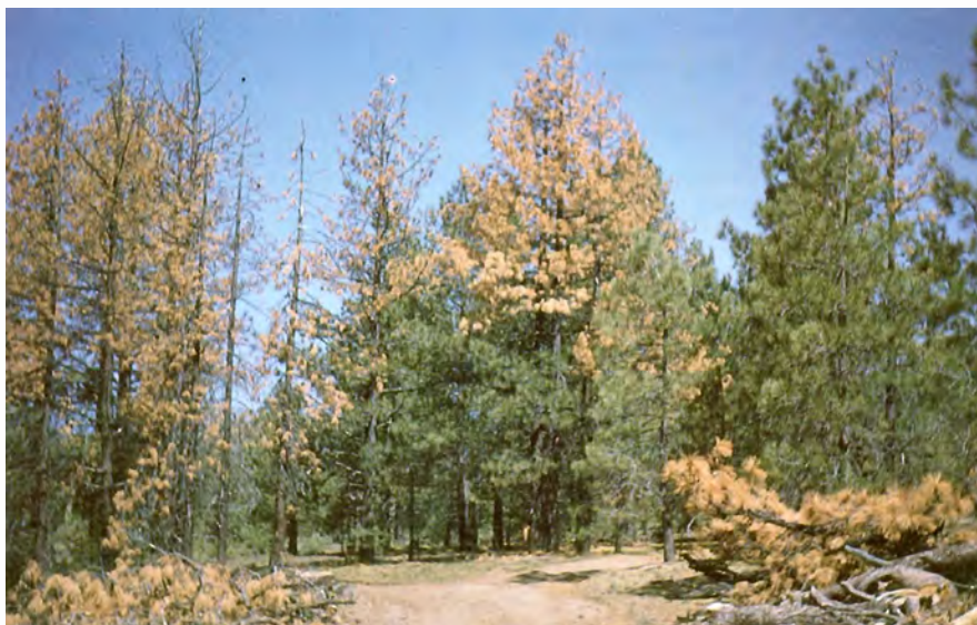
Figure 8 — Ponderosa pine killed by California fivespined ips population that built up in the slash piles in the foreground.