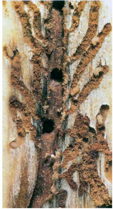
Figure 5 —Larvae in mines radiating from an egg gallery.