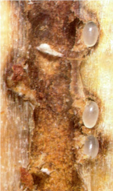
Figure 4 —Eggs in niches along a gallery.

to five spring/summer generations in addition to the overwintering one. Seasonal variations in temperature can also cause one generation more or less than average for a locality.