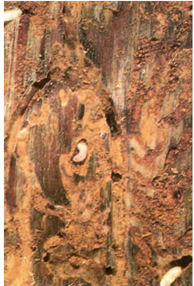
Figure 7—Under the bark: larvae, pupae, and adults in a Y-shaped egg gallery.