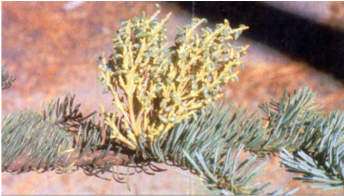
Fig. 3. Female shoots of fir dwarf mistletoe.

Fir live crown ratio has an important effect on the consequences of fir dwarf mistletoe. The effect of dwarf mistletoe on radial, height, and volume growth rates is greatest in trees with good live crown ratios (> 80%), the fastest growing, and become almost negligible in trees with live crown ratios < 40%, the slowest growing. On the other hand, trees with good live crown