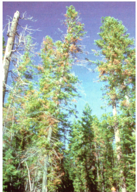
Fig. 4. Branch mortality and flags associated with fir dwarf mistletoe and cytospora canker in severely infested grand fir.

In mixed-species stands that contain fir infested by dwarf mistletoe, silvicultural treatments should favor other tree species. Non-hosts left between infected and non-