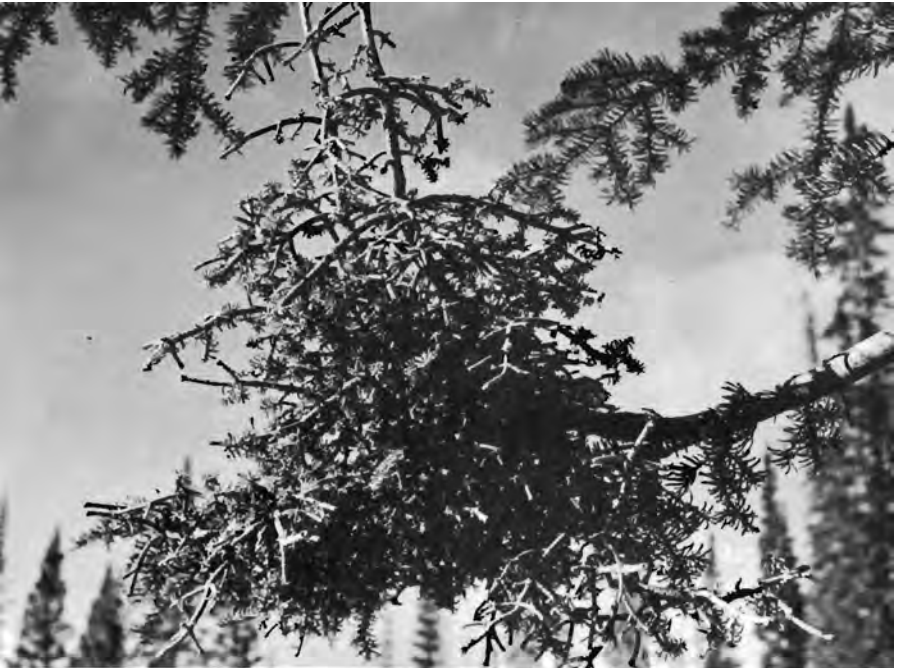
Figure 2.—In Melampsorella brooms, needles develop earlier in spring than healthy needles do, and are shed in autumn.

Pacific Coast States and the Southwest or by another rust ( Milesia pycnograndis ) in the Northeast, and occasional brooms of unknown origin, but only Melampsorella causes marked loss of chlorophyll and annual casting of all broom needles. By midsummer the new crop of needles is covered with orange rust spores. The infected branch or trunk becomes swollen at the base of a broom into a spindle-shaped or sometimes a nearly spherical gall or burl (fig. 3). The bark on old swellings, particularly on trunks, usually dies and becomes cracked, and open cankers may develop. Swellings and cankers may