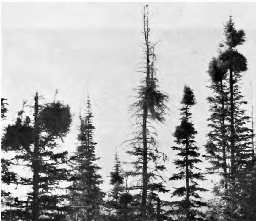
Figure 1.—Rust witches'-brooms and associated dead tops are abundant in many stands of subalpine fir.

entire range of firs in Eurasia and North America. The rust fungus occurs on its alternate hosts (chickweeds) beyond this range to 70° N. and 50° S. latitude. The disease is seldom more than a curiosity in the Eastern States, where few epidemics have been reported since it was first recorded in 1856. But in