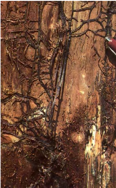
Figure 6 —Shoestringlike rhizomorphs between the bark and the wood of a grand fir.

the roots and on the lower stem, is needed to diagnose the disease (figs. 3 and 4).