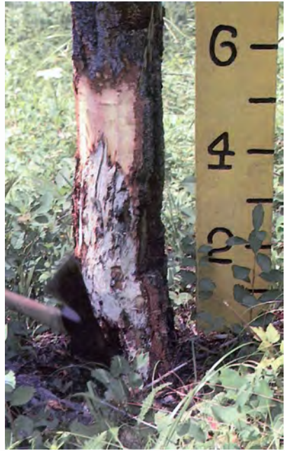
Figure 4 —Removing the bark at the base of the symptomatic ponderosa pine in figure 3 reveals the characteristic mycelial fans.

Because these fungi commonly inhabit roots, their detection is difficult unless characteristic mushrooms are produced around the base of the tree or symptoms become ob-