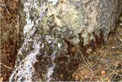
Figure 5 —Resin on a Douglas-fir. The first resin produced in response to the fungi turns dark brown but later is often covered with resin that retains a white sheen.

Trees affected by prolonged drought or attacked by rodents, bark beetles, or other fungi, particularly other root pathogens, can produce crown symptoms similar to those caused by Armillaria . Thus, additional evidence, often found on