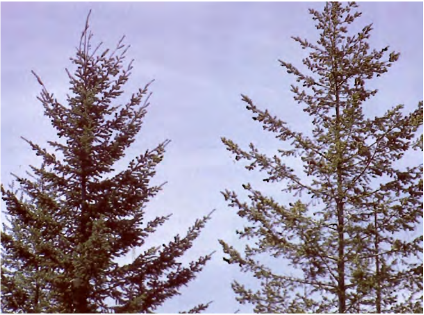
Figure 1 —The Douglas-fir on the right with sparse foliage and poor shoot growth has been infected for a number of years.