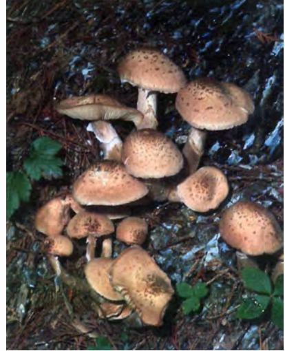
Figure 7 —A cluster of mushrooms at the base of a western white pine. The spores seem to be of limited importance in spreading the fungi.

fecting several trees to areas of up to 1,000 acres (400 ha). Within disease centers and on their expanding margins, trees in varying stages of decline are normally present. One or all species and sizes of conifers may be affected.