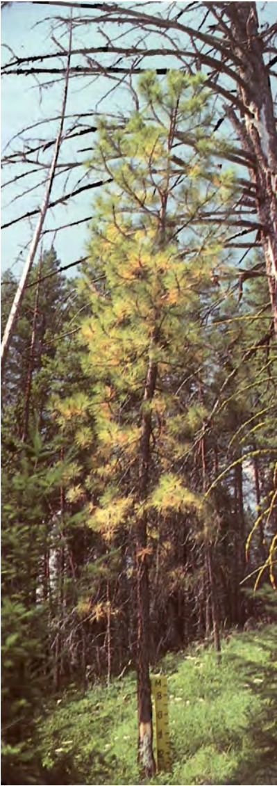
Figure 3 —Crown symptoms alone, such as those on this ponderosa pine, are not sufficient to identify the presence of Armillaria .