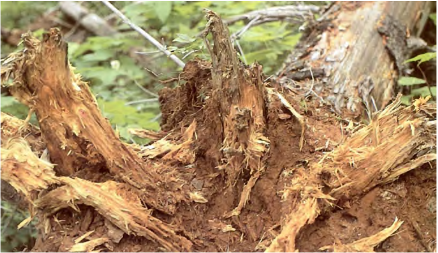
Figure 9 – Wood of Douglas-fir in advanced stages of decay is light yellow and stringy.