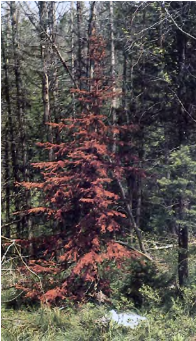
Figure 2 —This subalpine fir was killed rapidly and retained its full complement of needles.

predisposing them to attacks by other fungi or insects. Such behavior typically occurs in the relatively dry, inland coniferous forests of the Western United States.