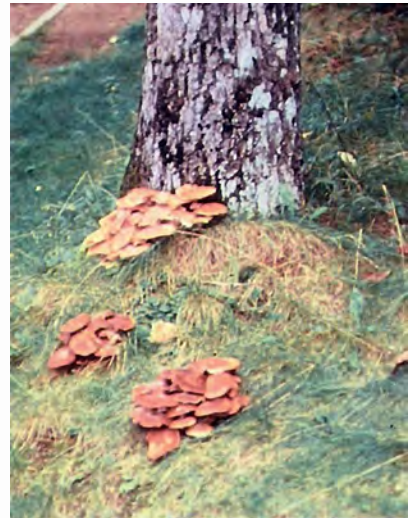
Figure 8 —A cluster of mushrooms on the root of a red oak.