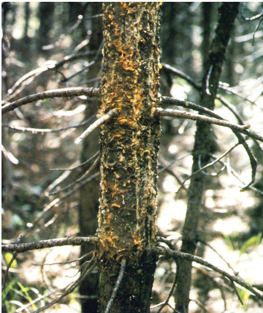
Figure 6 —Canker on the main stem of a lodgepole pine. As the fungus girdles the stem, the abundant resin flow colors the affected portion yellow.

that have occurred in the West have occurred in the Southeast.