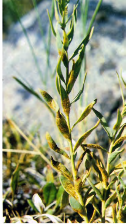
Figure 2— Comandra infected with the fungus.

Basidiospores from infected comandras are released from midsummer to