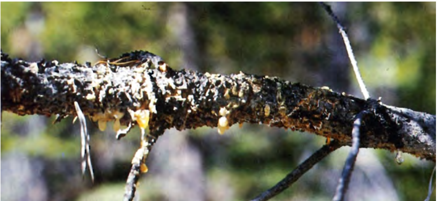
Figure 5 — Comandra blister rust canker on branch of lodgepole pine.

In the Southeast, the incidence of the disease and the amount of damage are closely correlated with the presence of the alternate host. There is no evidence that cyclic outbreaks similar to those