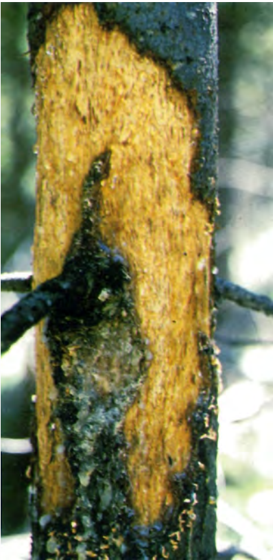
Figure 7 —Signs of rodent-feeding on a lodgepole pine infected with a comandra rust canker.

• Prune infected branches. This technique is useful in preventing stem infections on high-value trees. Any branch canker within 9 inches (22 cm) of the stem should be pruned.