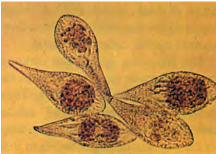
Figure 4 —Characteristically teardrop-shaped aeciospores of Cronartium comandrae .

Approximately 10 to 20 days after the comandras are infected, yellow blisterlike spots appear on their leaves. These spots produce yellow urediniospores, which infect other comandras. Several generations of the urediniospores may be produced in a single summer if moisture conditions are right.