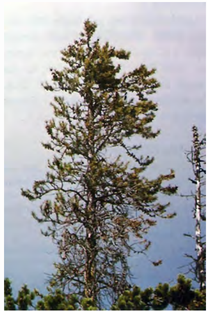
Figure 8 —Zone of dead branches in the crown, indicative of early decline. Spike top of tree on the right resulted from an earlier infection.

Eradicating the alternate host is not practical. In the Southeast, stand management practices that reduce or