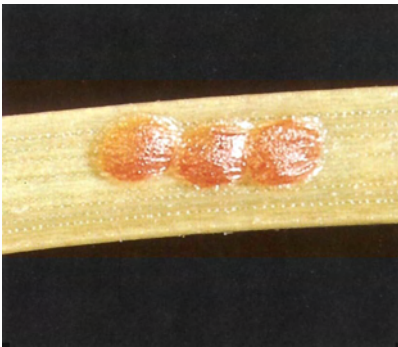
Figure 4. —Tip moth eggs on pine needle.

The tip moth egg (fig. 4) is elliptical; the upper surface is convex; and the underside, which is attached to the needle, is flat. When laid, eggs are