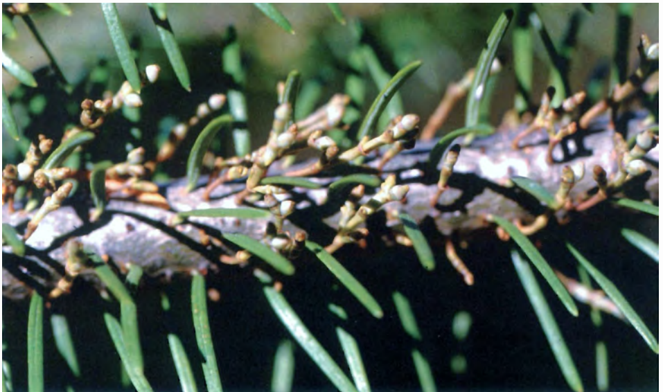
Fig. 2. Aerial shoots of Douglas-fir dwarf mistletoe.

The first symptom of Douglas-fir dwarf mistletoe infection is a slight swelling at the infection site 1 to 2 years after infection occurs. Initially these can be difficult to see. As time passes and the endophytic