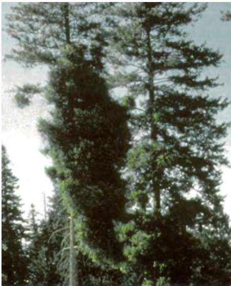
Fig. 3. Large witches' broom in a Douglas-fir.

Douglas-fir dwarf mistletoe typically becomes systemic within the host when the endophytic system invades tree buds at the infection site. Masses of invaded buds are stimulated to grow and develop long twigs, which eventually form witches' brooms. The mistletoe endophytic system grows apically at the same rate as the infected twigs. Aerial shoots can be found on branch growth segments ranging from 2 to 7 years old.