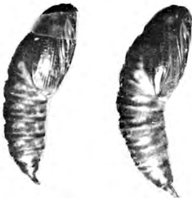
Figure 4.—Black-headed budworm larva.