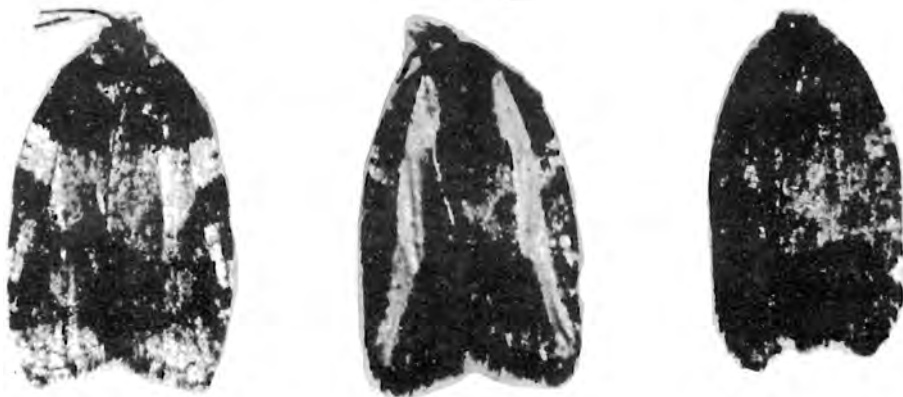
Figure 2.—Black-headed budworm adults showing some of the common variations in markings.

Black-headed budworm populations are normally held to low levels by several natural factors: