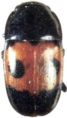
Figure 7. —Sap-feeding beetle. F-703172