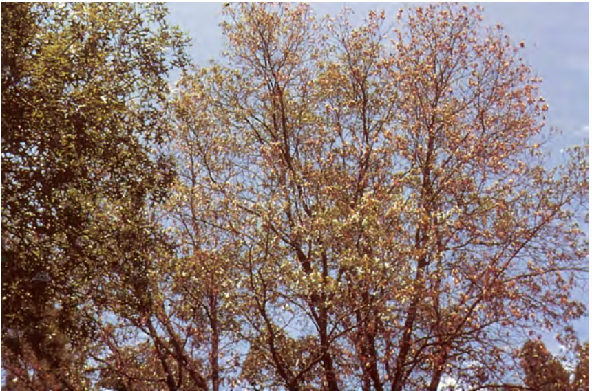
Figure 3. — Oak wilt symptoms.