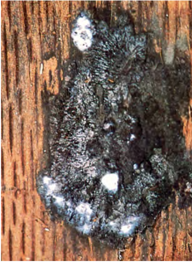
Figure 4. — Fungus mat.