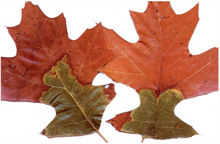
Figure 2. — Oak wilt symptoms on red oak leaves.