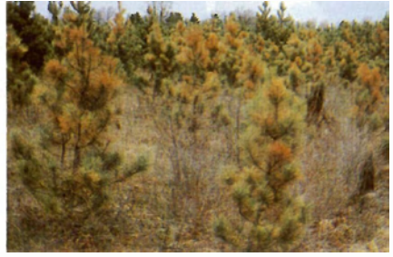
F-700413 Figure 2.—Red pine showing flagging symptoms from adult spittlebug feeding.

The first four nymphal stages, which are found in spittlemasses on the alternate host plants, have bright scarlet abdomens bordered by black at the sides and jet black heads and bodies. The fifth stage nymph is dark brown.