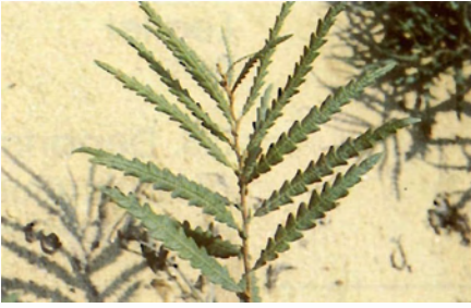
F-700412 Figure 1.—Sweet-fern plant—the principal host of the spittlebug nymph.

the 2-year-old internodes of the flagged branches will reveal tan or brown flecks on the surface of the wood and inner bark (fig. 3), which confirms the injury caused by this spittlebug. These are puncture wounds or scars that develop at the location of adult feeding. If these puncture wounds are numerous, the nutrient transport in the branches is restricted and the branches die, resulting in the flagging symptom.