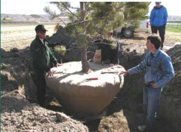
Participants in a large-tree planting workshop