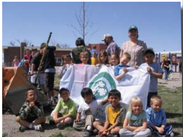
2008 Valier School Arbor Day Celebration

Urban and Community Forestry staff members provide technical assistance to more than half of Montana's communities for activities such as tree inventories, developing tree care ordinances, and developing community forest management plans. Assistance also includes services such as project and grant planning; workshops on topics related to tree care and maintenance; and community forestry presentations to schools and advisory groups. Urban and Community Forestry staff also provide assistance in volunteer coordination, helping communities organize and sustain the volunteer efforts that often are the heart of community forestry programs.