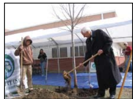
Tree planting as part of Arbor Day events in Townsend with Lieutenant Governor Bohlinger

Persons with disabilities who need an alternative, accessible format of this document should contact the Montana Department of Natural Resources and Conservation Forestry Division, 2705 Spurgin Road, Missoula, MT 59804-3199. Phone (406) 542-4300 or fax (406) 542-4217. 1,000 copies of this document were published at an estimated cost of $0.77 per copy. The total cost of $765 includes $765 for printing and $0 for distribution.