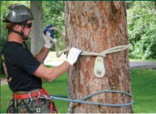
Participant in a tree climbing and rigging workshop