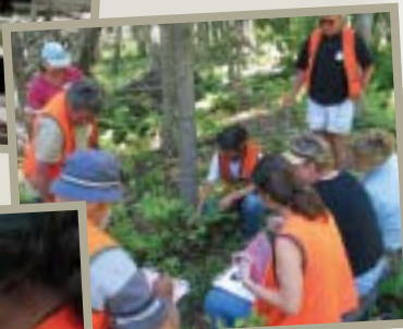
Participants learning methods for an inventory of their own forestland.