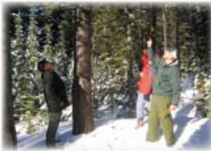
Service Foresters helping landowners assess their forest's condition (above) and develop a management plan (below).

DNRC Service Foresters typically assist landowners whose needs are quickly met, or who feel they do not need a consultant. Some landowners require more extensive assistance, or wish to employ a consultant; DNRC has developed a directory of forestry consultants to help these landowners locate further assistance.