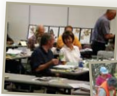
Forest Stewardship Workshop participants in the classroom and in the field.

Montana's approach to stewardship planning is a little different from most states, in that plans are prepared by landowners with the guidance of natural resources professionals, rather than prepared for landowners by natural resources professionals. Montana's approach offers an alternative for landowners who want to become personally involved with their property and make better-informed management decisions. By working and learning