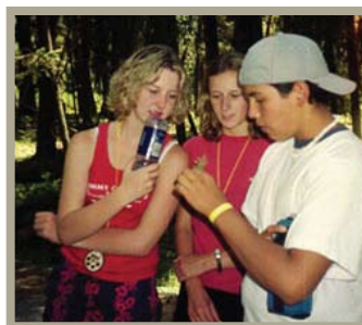
Through the Conservation Education Program, DNRC has helped launch Project Learning Tree (PLT), and helped sponsor the 2008 Montana Natural Resource Youth Camp - programs aimed at providing educational opportunities for youth (K-12) in Montana.

The Forest Stewardship Program helps fund a number of one-day workshops delivered by MSU Extension Forestry that provide specialized follow-up to the Forest Stewardship Workshops on topics such as wildfire hazard reduction, windbreaks/living snowfences, tree pruning and care, riparian forest stewardship, and forest roads maintenance.