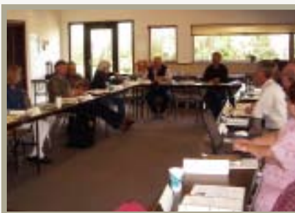
Meeting of the Montana Forest Stewardship Steering Committee.

Partnerships with other agencies, organizations, and individuals are critical to the success of the Forest Stewardship Program. Key partners include the USDA Forest Service State and Private Forestry Program, MSU Extension Forestry, Montana Logging Association, Montana Wood Products Association, University of Montana College of Forestry,