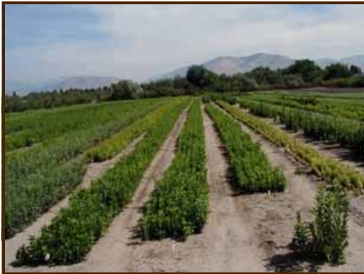
DNRC Conservation Seedling Nursery