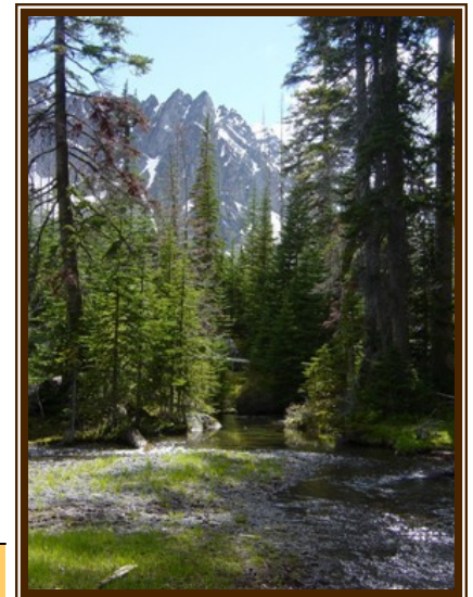
DNRC Forestry and Trust Land Management Division programs seek to protect and manage Montana's natural resources for the benefit of current and future generations.

GOAL: ENHANCE ORGANIZATIONAL EFFECTIVENESS AND ACCOUNTABILITY THROUGH APPROPRIATE DEVELOPMENT AND IMPLEMENTATION OF ACCOUNTING, INTERNAL CONTROL, AND INFORMATION TECHNOLOGY PROCEDURES.