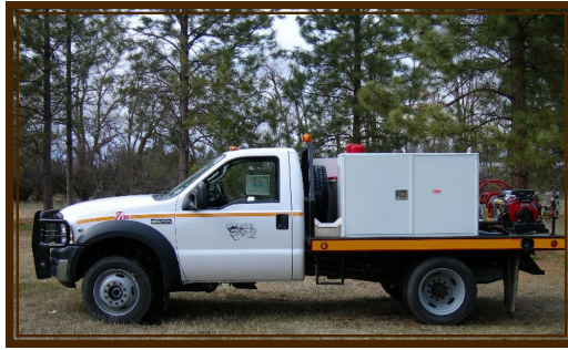
DNRC's Equipment Development Center will build 14 new engines in SFY12 to deliver to Montana counties as part of the County Cooperative Fire Program.

wildland engines for local government and DNRC use on fire suppression response.