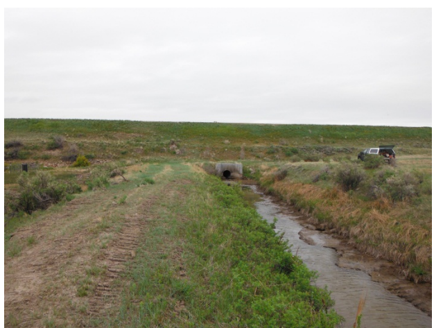
Outlet and downstream face of dam

Estimated Cost of the above repairs: $500,000