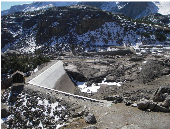
North (top) and South Dams