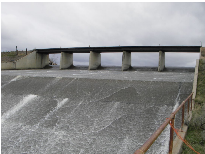
Spillway and county road bridge