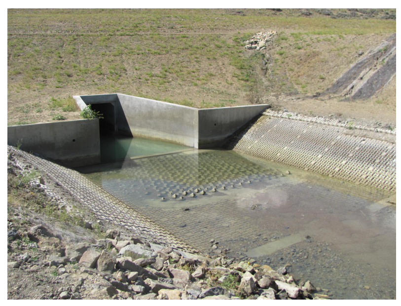
Terminal outlet structure

The project was rehabilitated in 2009 - 2013 and meets or exceeds current dam safety standards. No deficiencies currently exist.