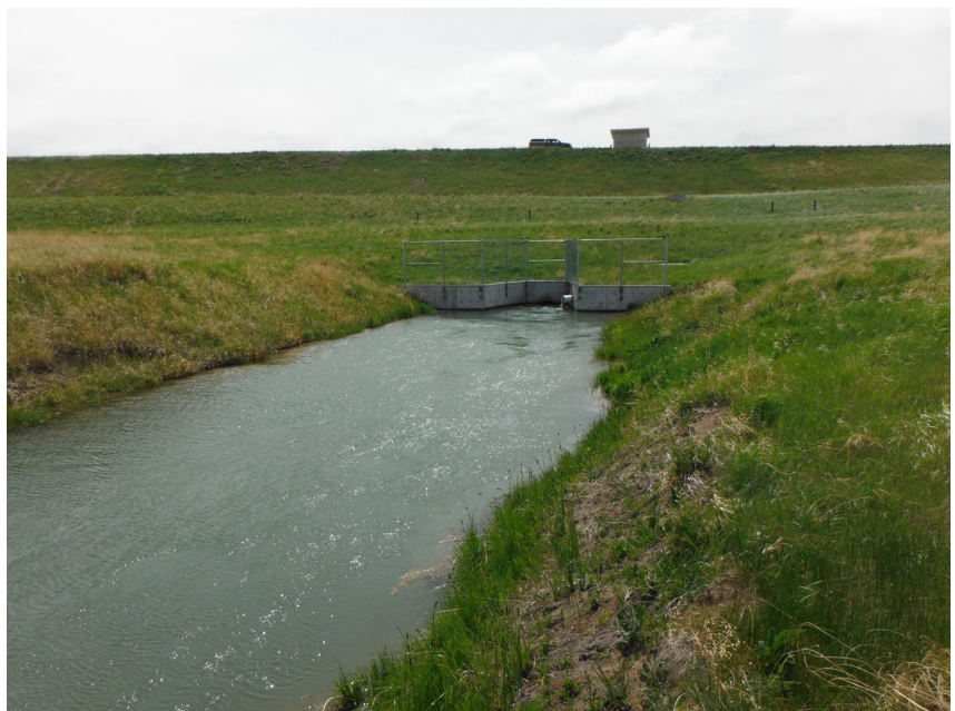
Outlet and gatehouse located on dam crest