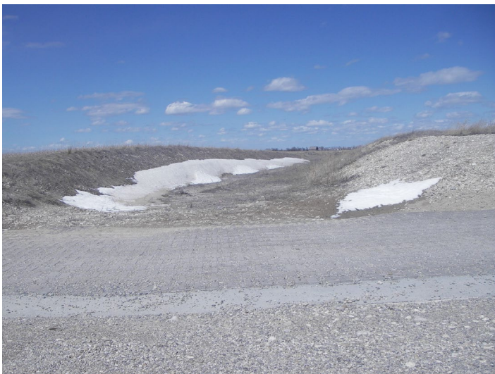
Spillway approach and earthen spillway

The project was rehabilitated in 2009 and meets or exceeds current dam safety standards. No deficiencies currently exist.