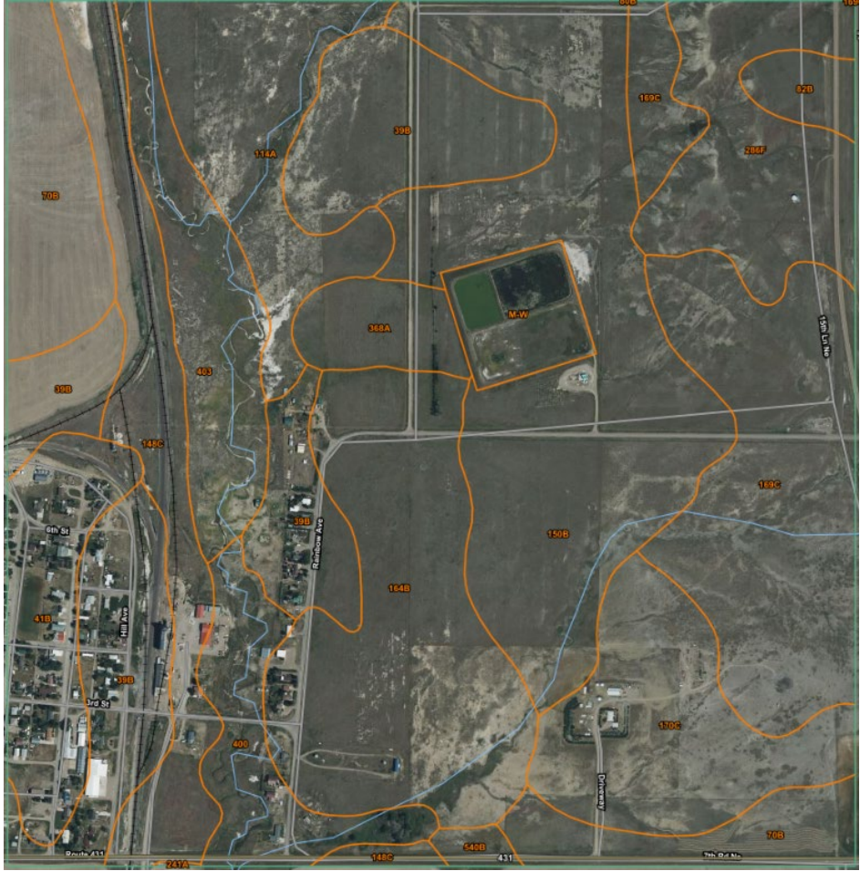
Figure 6: Map of Web Soil Survey Soil Types in Section 25, 23N 1W, Teton County